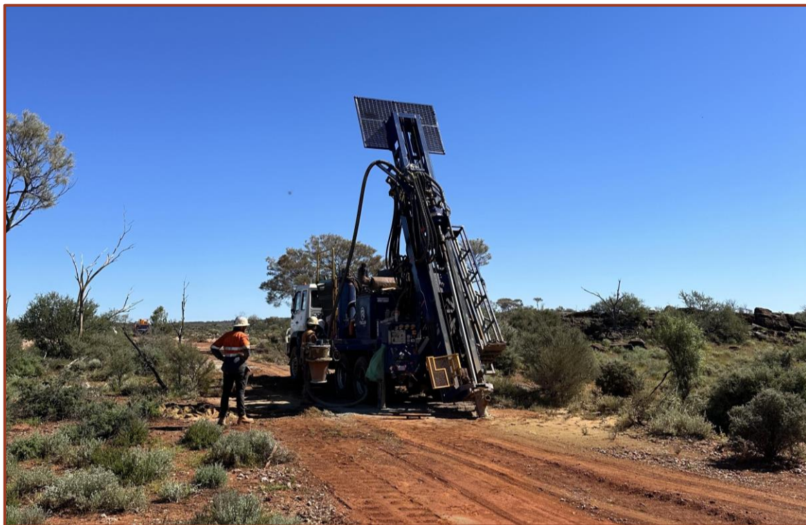
Figure 1 – Drilling at Edjudina Gold Project

M3 Mining Limited (ASX: M3M) ( M3 Mining or the Company ) is pleased to provide an update on drilling operations at the Edjudina Gold Project ( Edjudina or the Project ), located approximately 150km northeast of Kalgoorlie, WA.