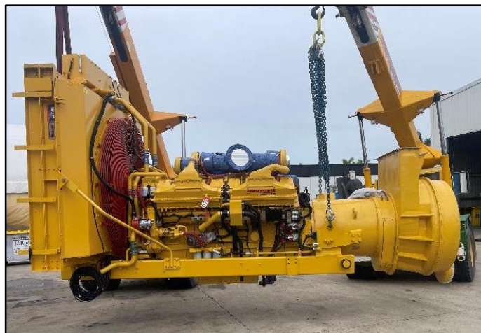
Mobilisation of QSK60 module at PPQ facility

Babylon is seeing growth in profitability in both WA and QLD, and the Company continues to execute strategic initiatives to optimise segment stock and inventory to unlock cash for working capital.