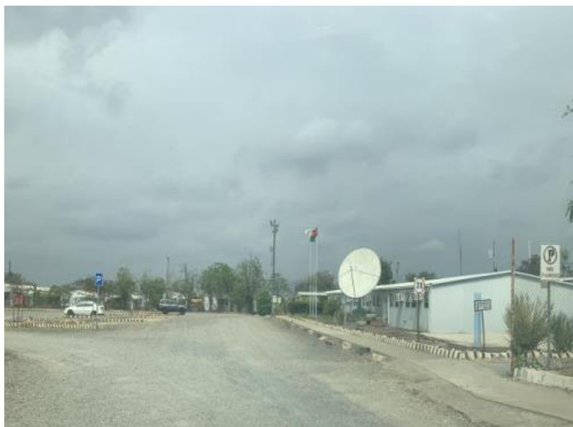
Figure 9: Entrance to Zalewa Camp