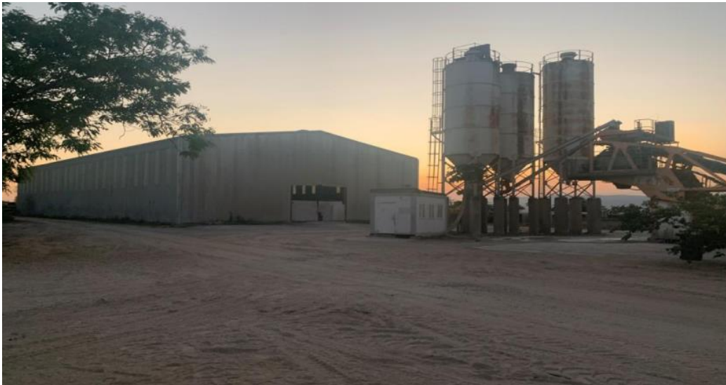
Figure 8: Proposed Storage shed to be utilised by Chilwa Minerals

The Agreement includes the provision of accommodation and office facilities in Malawi, technical and administrative support staff, 4WD and support vehicles and other infrastructure, including a large storage shed which will be utilised for storing samples.