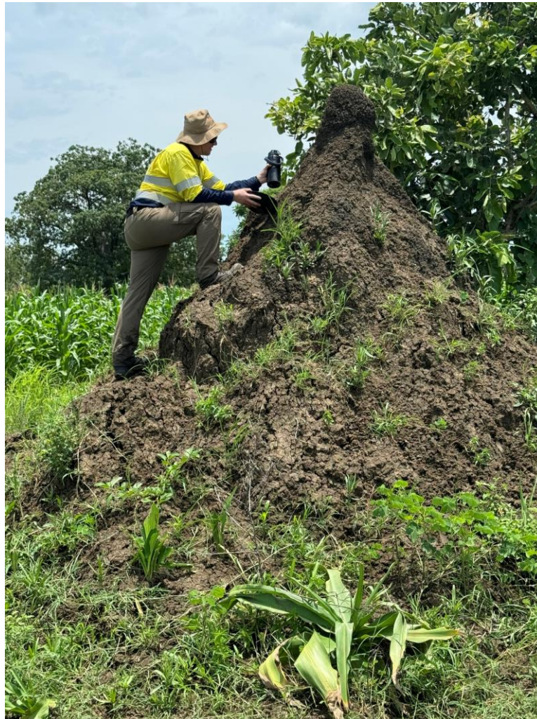
Figure 3 Project Geologist Will Horne at a typical termite mound in the Namaslima region

Initial reconnaissance of Namaslima commenced with testing of termite mounds for early mineralisation indication. The company also commenced community consultation with stakeholders in preparation for mobilisation of the drill rig.