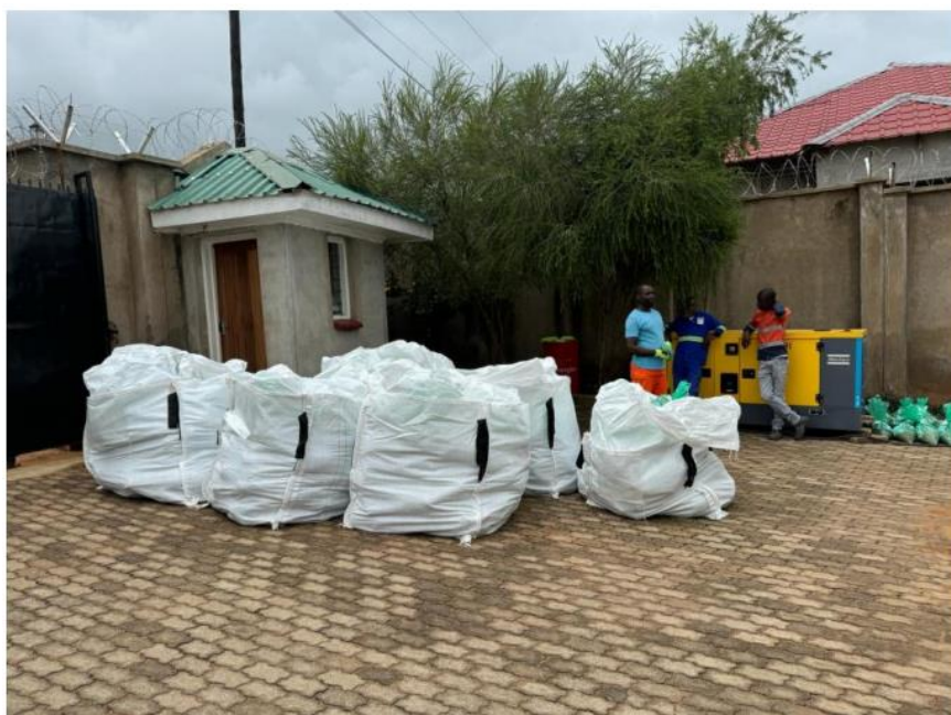
Figure 4: Samples packaged awaiting loading at Chilwa Minerals base in Zomba.