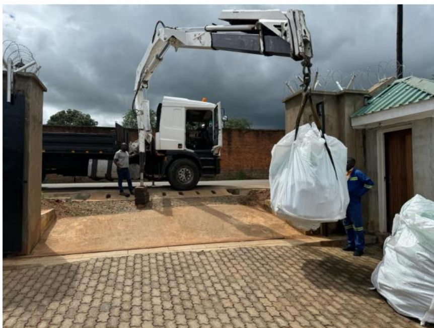
Figure 5: Samples being loaded onto truck for dispatch.