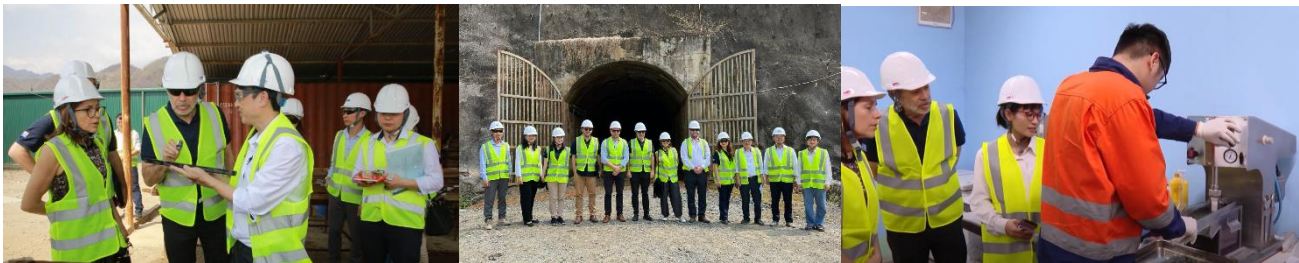
Figure 4: Site visit of the Ban Phuc Nickel Mine

The visit was concluded with a boat trip from the mine in Bac Yen District to the Ta Khoa Refinery location in Phu Yen District. The Company was able to highlight to the Ambassador and the Son La PPC representatives the huge benefit of using the Da River for managing logistics. Barging is not only a lower cost transportation method, it also enables a lower carbon footprint and most importantly it eliminates the interaction with the community which has been deemed a high risk activity.