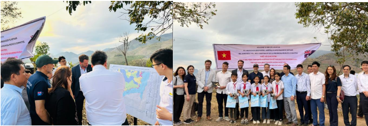
Figure 7: Donation of school supplies