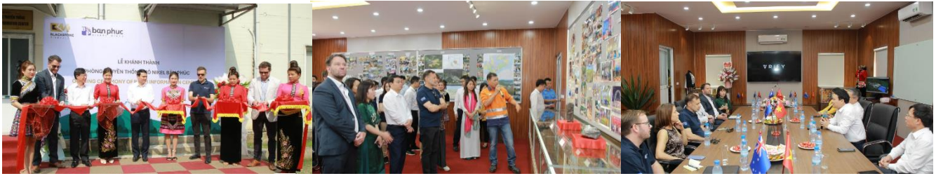
Figure 3: Opening of the Blackstone Information Centre

The Ambassador then undertook a site visit of the Ban Phuc Nickel Mine, inspecting;