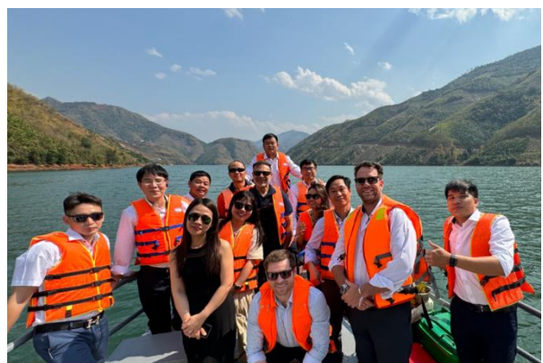
Figure 6: Ta Khoa Mine to Refinery

The delegation inspected the proposed refinery location noting the remoteness, logistical advantages and the low population density leading to minimal resettlement requirements which is a ESG cornerstone to our Green Nickel™ strategy. The Ambassador took the opportunity to meet with the local Commune leaders and local school children to donate school supplies and a small piece of Australia.