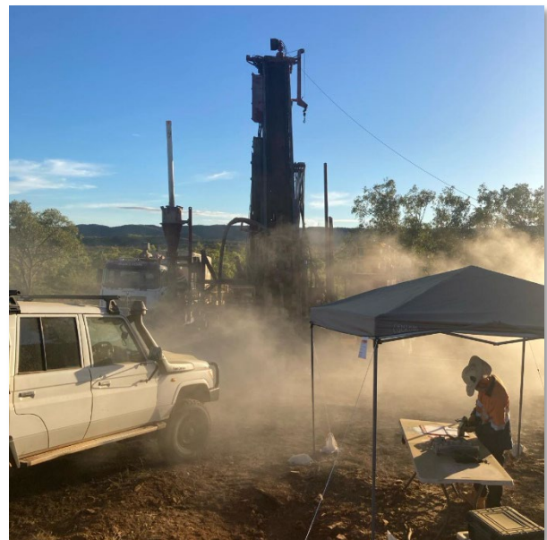
Plate 1: RC drilling in April