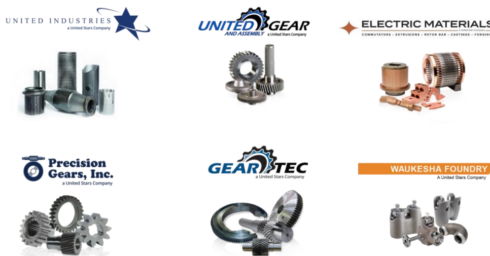
Figure 2: United Stars companies

IperionX partnered with United Stars Holdings, Inc. (United Stars) for the potential supply high-performance, low cost and sustainable titanium products. The partnership agreement includes terms that will underpin a definitive commercial supply agreement for IperionX’s titanium products. United Stars expects to purchase up to 80 tpa of high-performance, low cost and sustainable titanium products over a 10-year supply term.