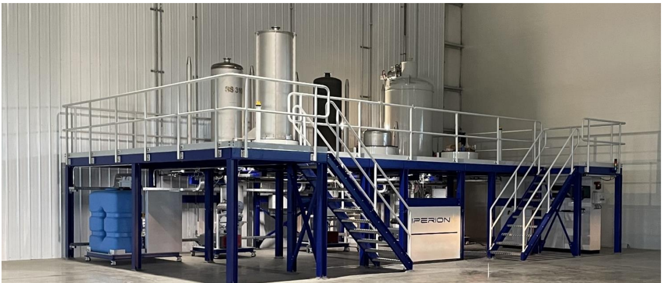
Figure 1: HAMR titanium furnace installed at the IperionX Titanium Production Facility

Phase I full run rate target capacity of 125 tpa is anticipated by the end of 2024 and then expected to scale-up to a target production capacity of 2,000 tpa in 2026.