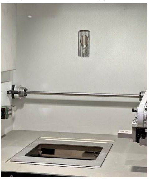
Close-up detail of the AL250 printing chamber in assembly

As the first built machine will be fully deployed within our industrial print services business to support our ongoing services expansion, the superalloy Inconel 625 has now been selected as the preferred choice of materials for the initial phase of machine start-up. Parts such as micro turbine combustion chambers will be printed. Material selection is vital in targeting customers within our print services business, with a need to be served by suitable availability of versatile printing materials, supporting defence, aerospace and oil & gas/resources applications.