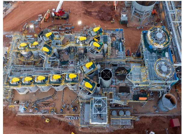
Figure 12: Flotation cells at the wet plant