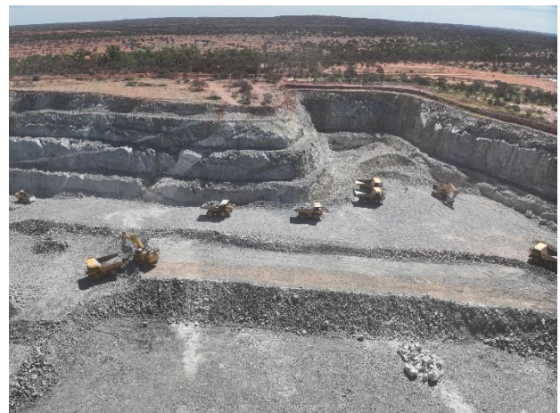
Figure 6: Multiple Visible ore zones at Kathleen’s Corner Pit