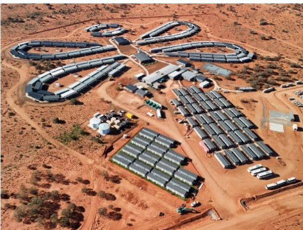
Figure 23: Aerial photograph of the Dragonfly Village

As the Project progresses through its peak construction phase, the accommodation village remains fully utilised with over 900 people working on site. Camp construction works are nearing final completion.