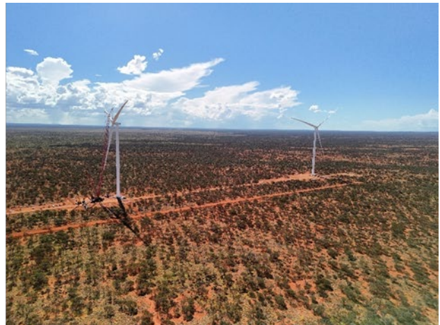
Figure 21: Wind farm