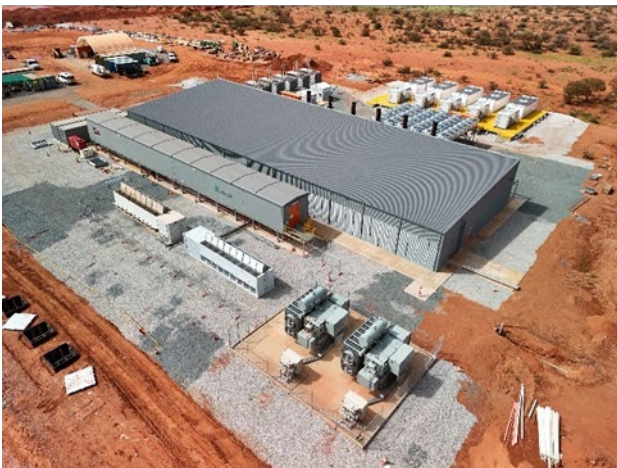
Figure 20: Power station engine hall and Battery storage

These energy sources will progressively be brought online from next quarter, in-line with plant commissioning requirements. From next quarter, renewables are expected to be supplying part of the power for construction and commissioning activities, as well as feeding the camp and underground mining infrastructure.