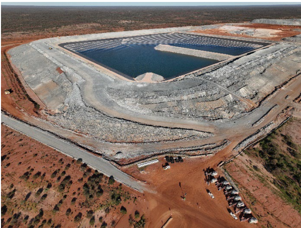
Figure 7: Tailings Storage Facility (TSF) Cell 1

The Tailings Storage Facility (TSF) cell 1 continues to be filled with raw water from onsite bores and seasonal rainfall, with the water to be used to support start-up processing operations. The majority of tailings discharge header and dropper pipework has also now been installed.