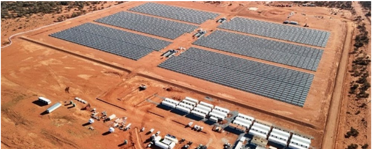
Figure 22: Aerial photograph of the ~31,000 solar panel farm and temporary construction camp