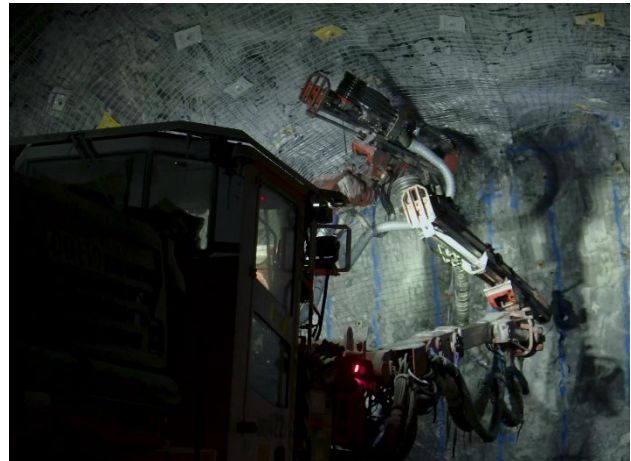
Figure 4: Jumbo operating underground