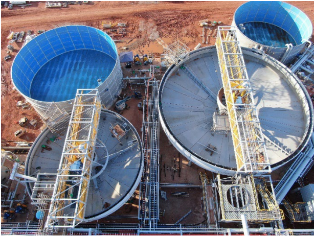
Figure 14: Process and Tails thickeners