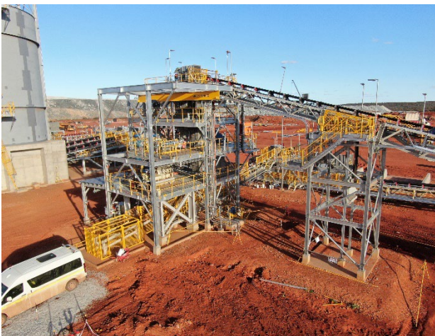
Figure 16: Recycle crushing