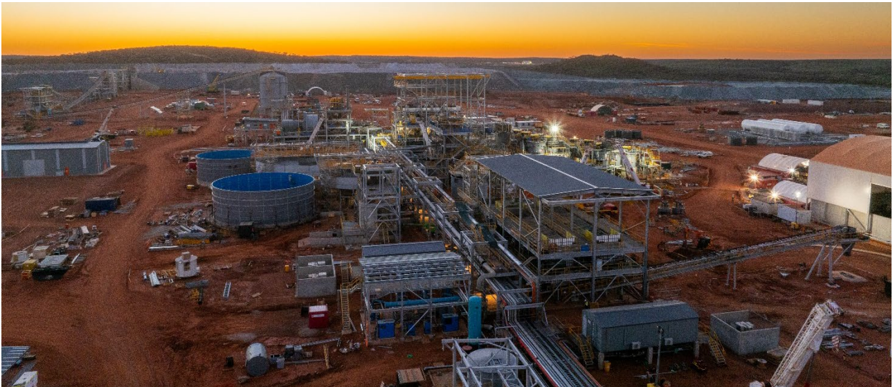
Figure 13: Process plant looking East