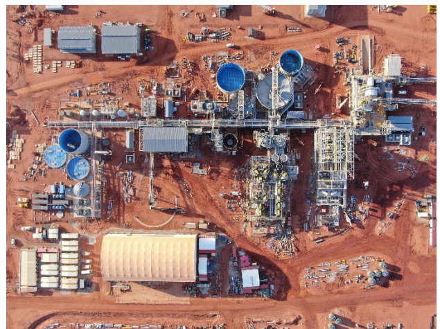
Figure 17: Plant Overhead