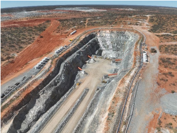
Figure 3: Portals at Mt Mann box cut

A total of 1,535 development metres was achieved during the quarter, continuing the strong trajectory of progress since the commencement of underground mining in the prior quarter. Equipment and personnel mobilised to site as planned for this phase of development. Metres advanced and ground conditions experienced continue to be in line with the mine plan and expectations.