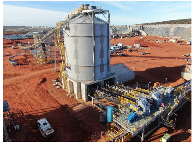
Figure 15: Fine Ore Bin and Feeders