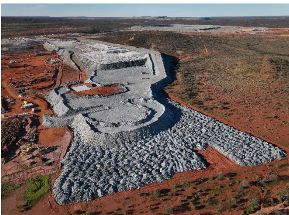
Figure 1: Aerial photograph of the ROM and OSP pads

The ore sorters arrived on site and construction of the OSP pad commenced adjacent to the ROM pad. Ore sorting is planned to commence in the June 2024 Quarter.