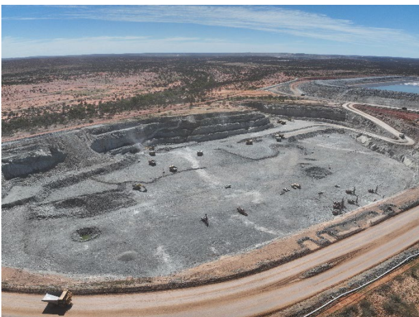
Figure 5: Progress continues at Kathleen’s Corner Pit