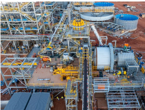
Figure 11: Power to the SAG mill commenced late March