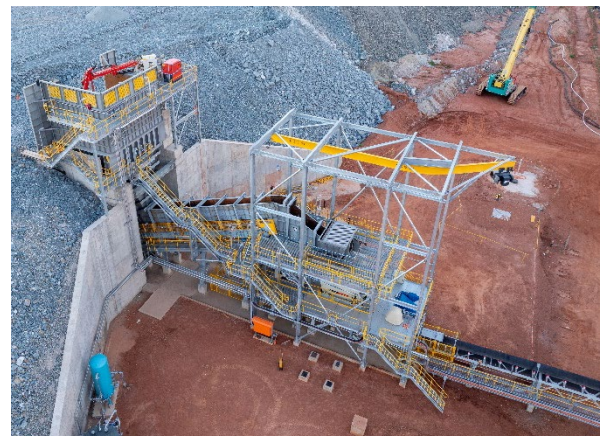
Figure 2: Primary crusher