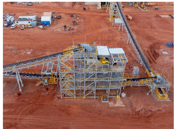
Figure 10: Secondary Screening Building