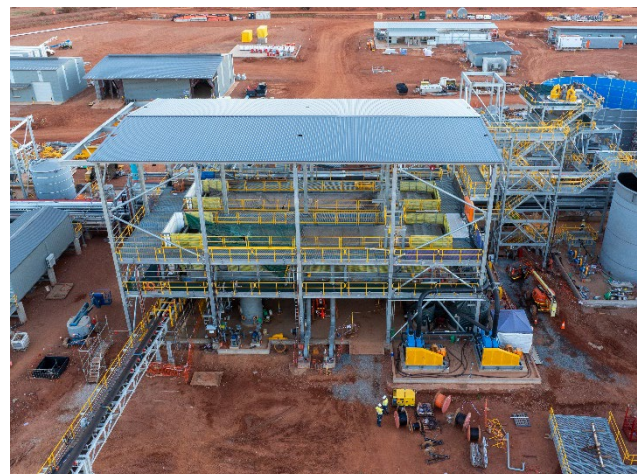
Figure 19: Belt Filtration Area