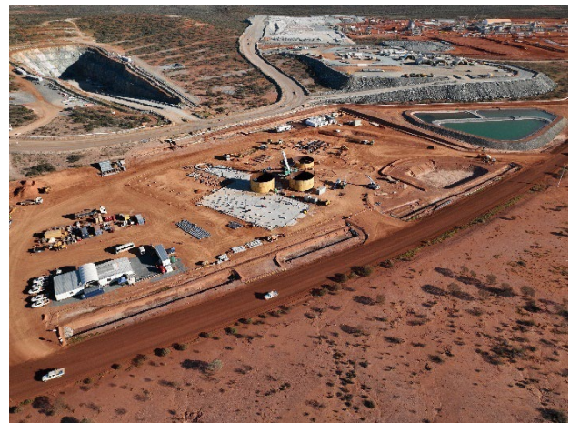
Figure 8: Paste plant construction underway