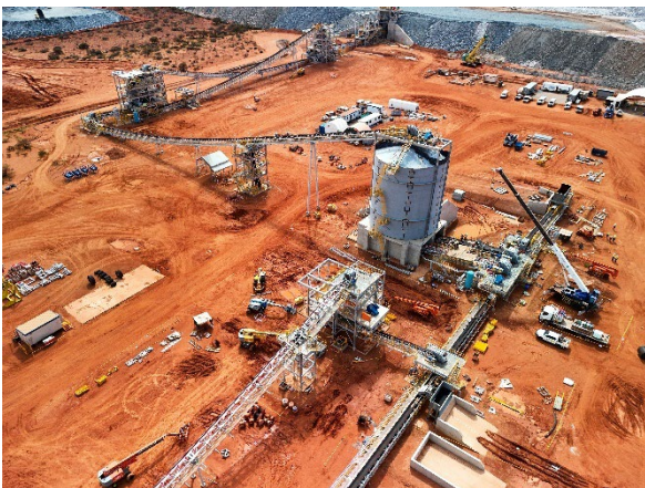
Figure 9: Dry plant commissioning commenced late March

Multiple pieces of equipment, including the crusher, have been run, with first ore imminently planned to be fed into the dry plant.