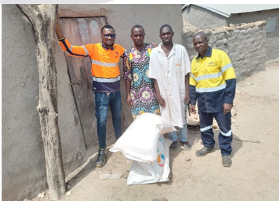
Figure 16: Donation of 100kg of sugar to celebrate Ramadan