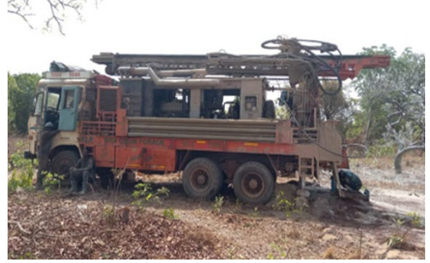
Figure 15: Drilling of bore holes for local market gardens

In addition, the development of two separate 2-hectare market gardens, to be run by a recently formed women's cooperative also commenced. The area for each market garden has been selected and drilling of bore holes, to provide water for each garden also completed. It is anticipated that planting and first crop harvest will occur during the June guarter.