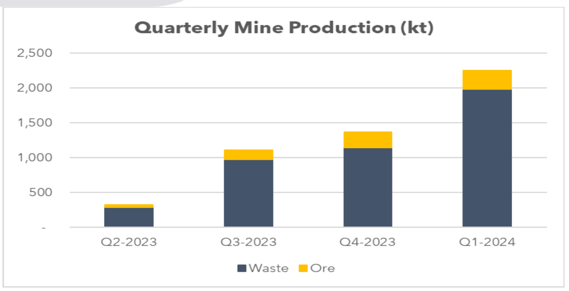
Image3: Quarterly Mine Production