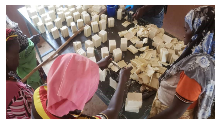
Figure 14: Women in Goulamina making soap

Leo Lithium is dedicated to upholding modern ESG practices, aiming to make a significant and impactful contribution to Mali. During the quarter, the Company implemented a number of income generating programs designed to provide alternative revenue streams for impacted communities, outside of direct employment. This includes the development of a women's soap making business involving 60 women from Goulamina and Mafele. This business is already thriving with the products produced by the women's group selling out and plans for the Company to purchase a number of these soap and detergent products for use within its camp accommodation and messing facilities.