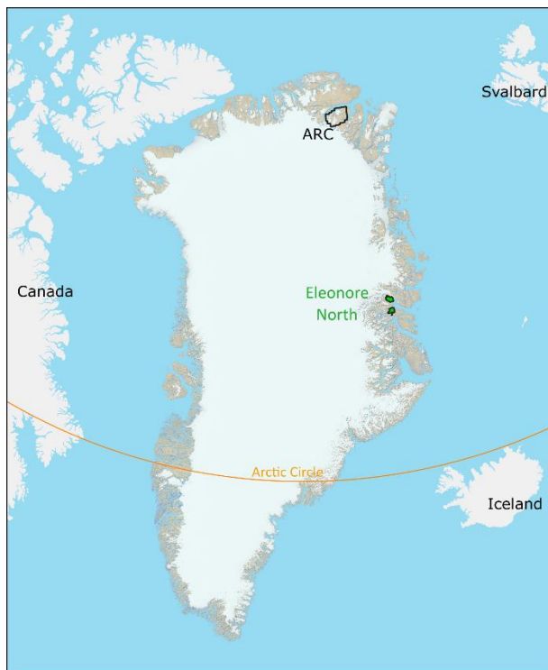
Figure 2: Map of Greenland showing GreenX's ARC and Eleonore North license areas

The primary target in Eleonore North is the Noa Pluton, followed by the Holmesø prospect and its source intrusion. The Noa Veins provide a near-term drill target, however, the Company's 2023 field work was focussed on determining the depth of the causative intrusion with greater precision using a passive seismic survey. Once analysed, this information will validate the magnetic interpretation, provide more certainty for a future exploration program, and help identify the size of the intrusion within the well-defined hornfels.