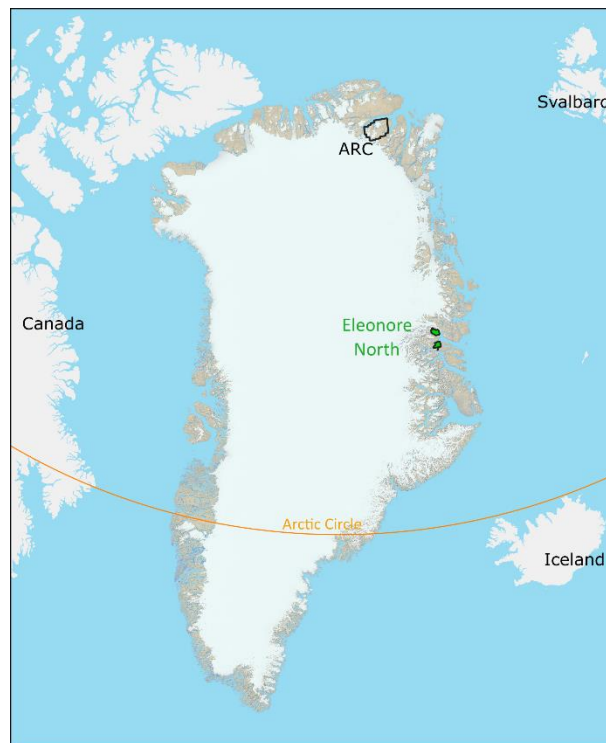
Figure 1: Map of Greenland showing GreenX's ARC and Eleonore North license areas

The Company is in the process of analysing further remote-sensing options for ARC, which would be used to supplement current understanding of the known copper sulphide mineralisation and refine plans for the next exploration program.