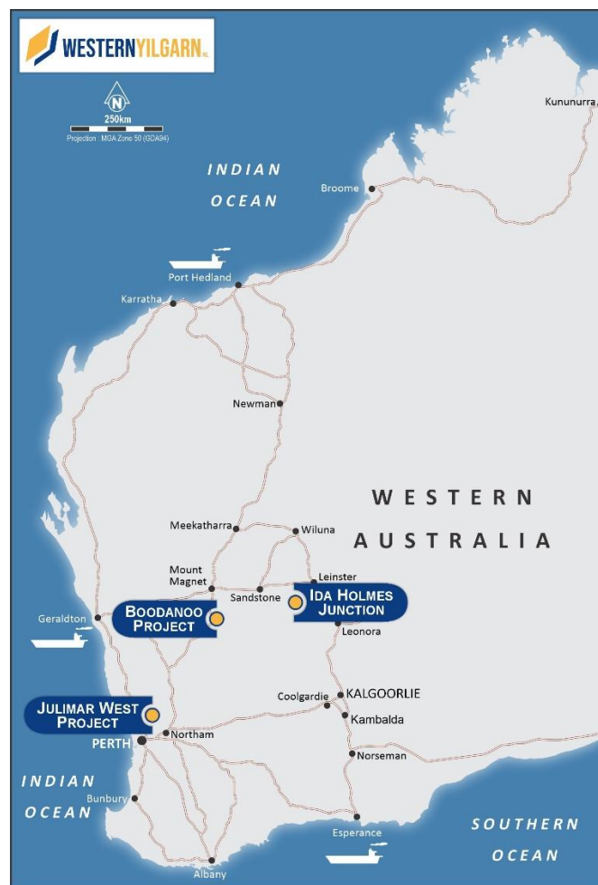
Location of Western Yilgarn portfolio