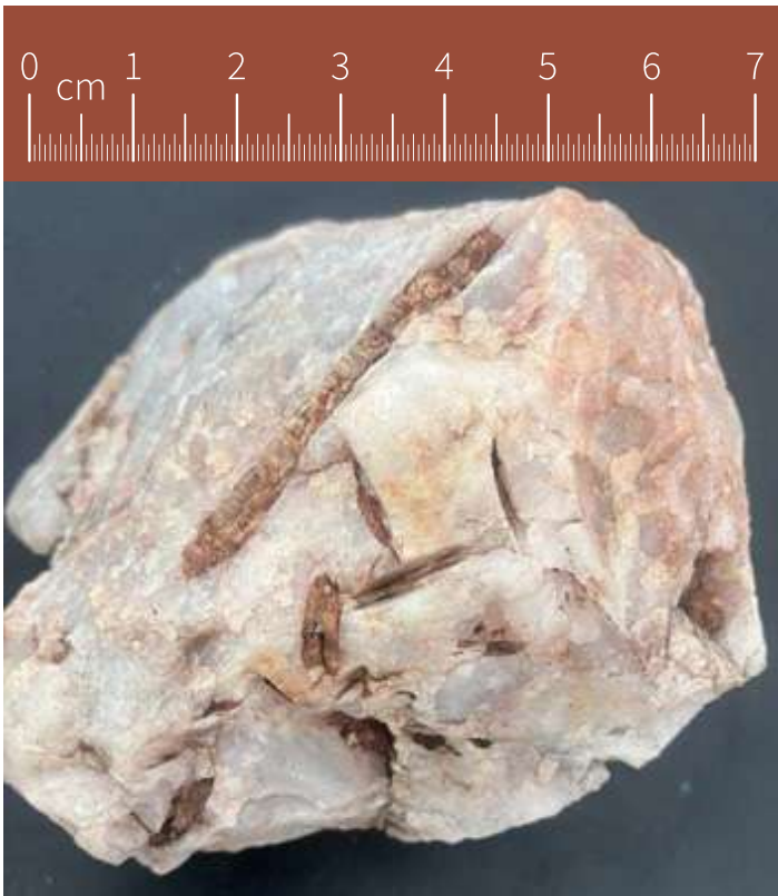
Above: Euhedral beryl and muscovite on contact margins of quartz vein within greisen of the Chevy Creek granite, New Goldfield Project. Sample is approximately 7cm across.