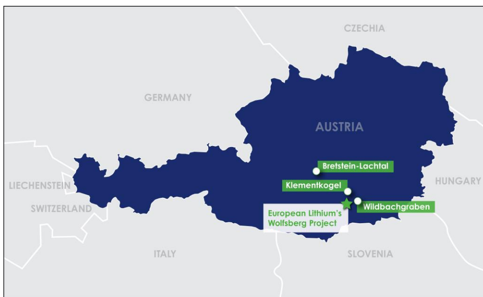
Figure 1. Austrian Lithium Projects location

An initial work program consisting of stakeholder engagement, geological mapping, stream sampling and soil sampling in order to determine target areas for follow up detailed exploration will commence in Q2/2024.