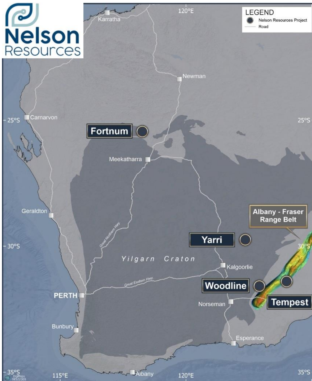
Figure 1: Project Locations.