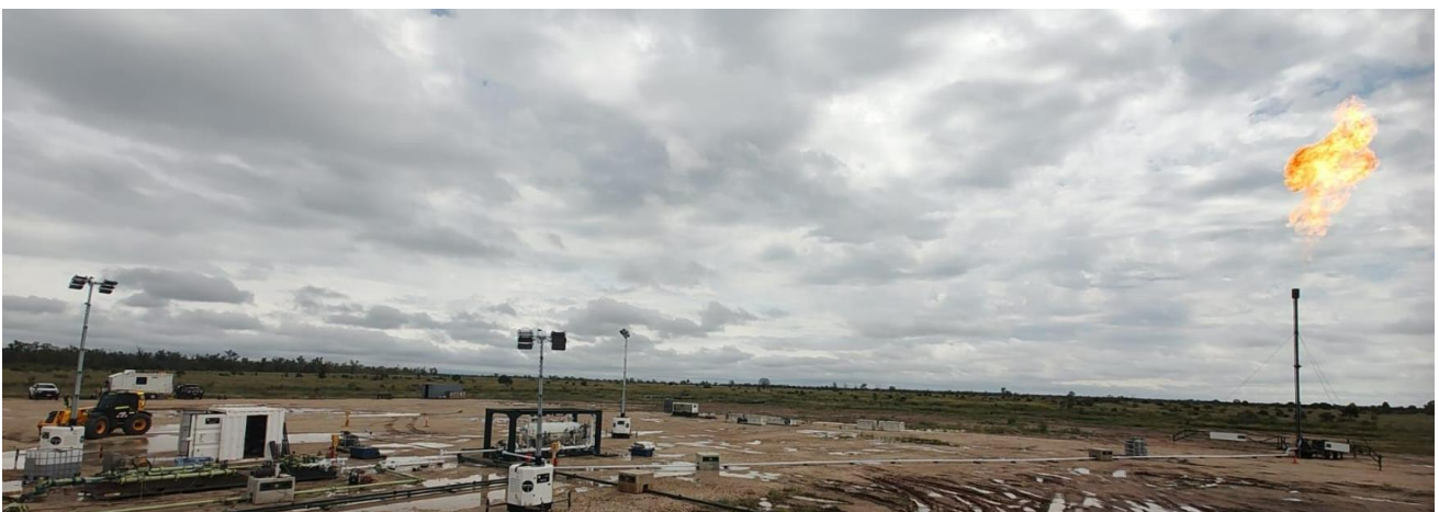
Daydream-2 Lease during 2 nd flow period of Lorelle Sandstone

This activity is occurring at a time of now widespread recognition that the East Coast Australian gas market faces imminent supply shortfalls, prices are high and expected to stay high, and growing international geo-political tensions put a premium on LNG supplies from stable countries like Australia.