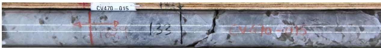
Figure 4: Large spodumene crystal(s) in quartz pegmatite, drill hole CV24-470 at ~133 m depth.