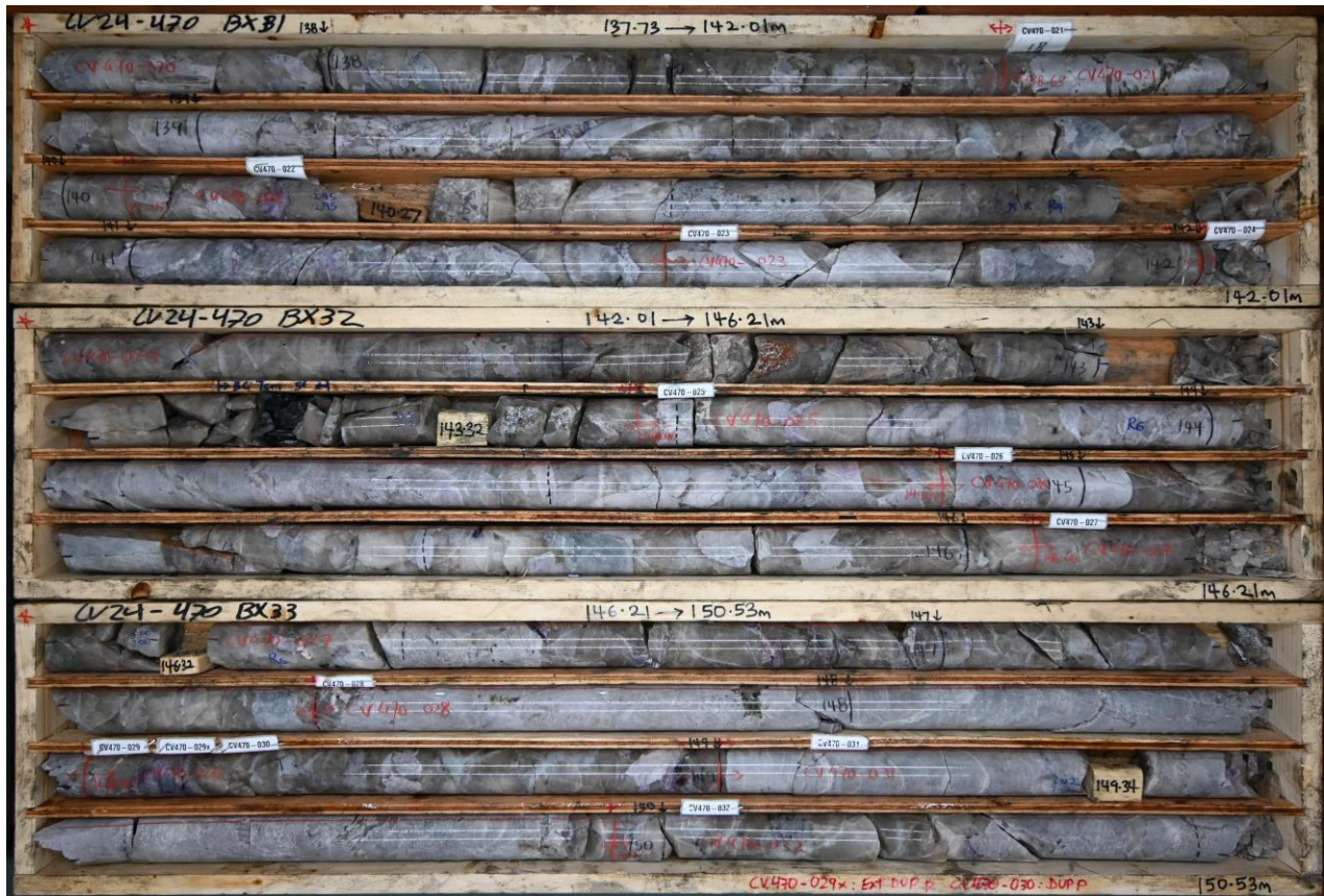
Figure 3: High-grade spodumene pegmatite intercept in drill hole CV24-470 at CV13. Core grades ~3.0% Li 2 O over interval presented (137.7 m to 150.5 m) and 6.33% Li 2 O from 147.5 m to 148.4 m.