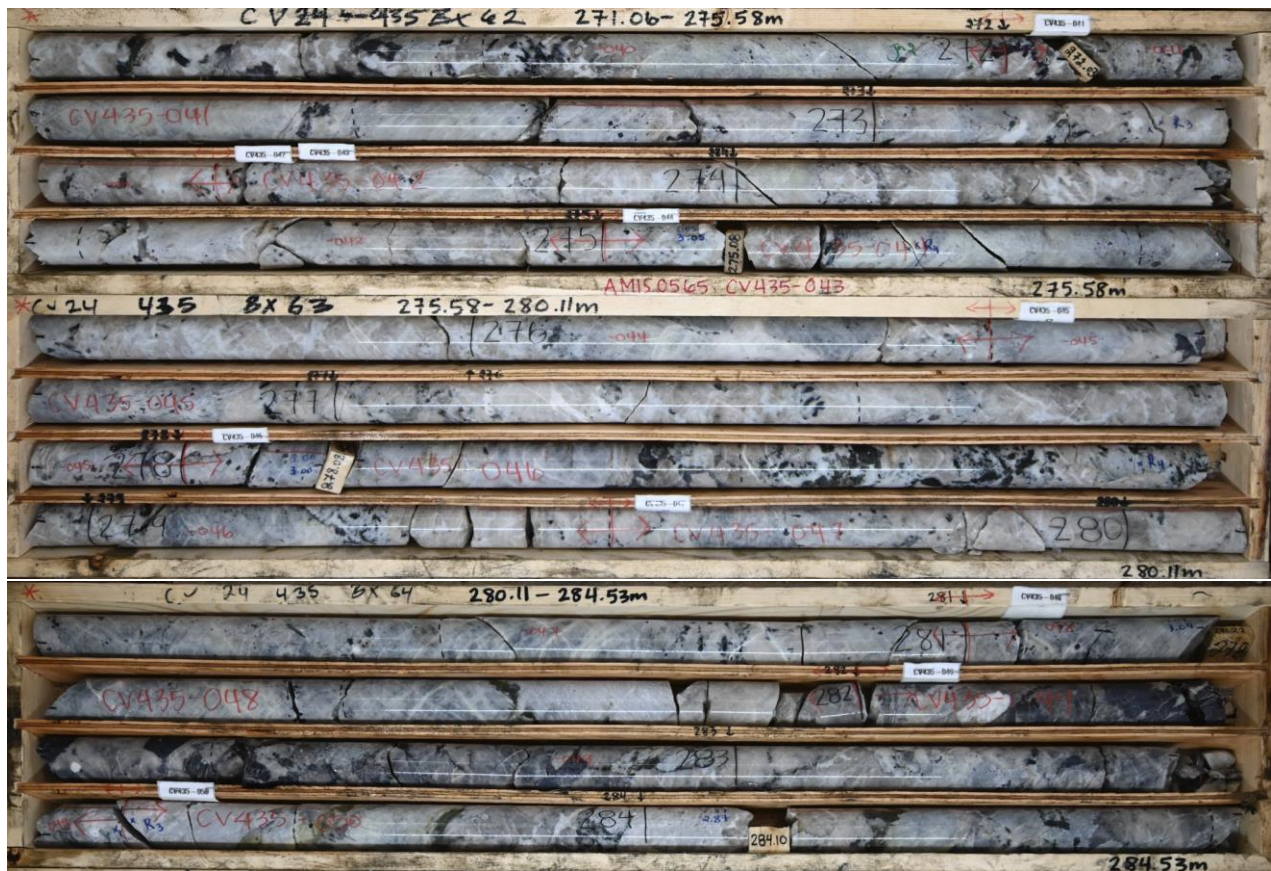
Figure 2: High-grade spodumene pegmatite intercept in drill hole CV24-435 at CV5. Core grades ~2.9% Li 2 O over interval presented (271.0 m to 284.5 m) including 4.77% Li 2 O from 281.0 m to 282.0 m.

Core sample assays for drill holes reported herein from the CV5 Spodumene Pegmatite are presented in Table 1 for all pegmatite intersections >2 m. Drill hole locations and attributes are presented in Table 2.