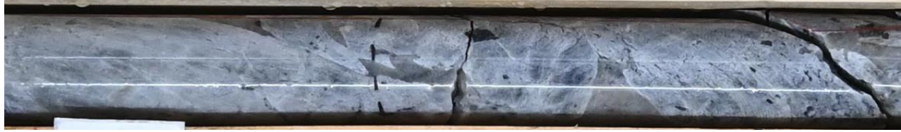
Figure 3: Large spodumene crystal(s) in quartz pegmatite, drill hole CV24-435 at ~31 | 1.5 m depth.