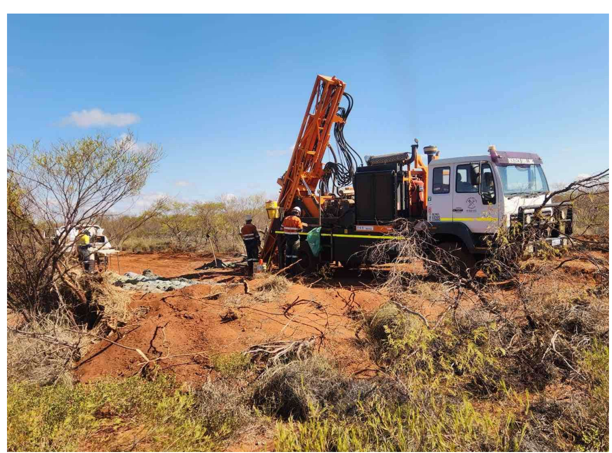
Figure 1: Drill Rig at Mt Berghaus

Mantle Minerals Limited (ASX:MTL) ("the Company") is pleased to announce that drilling has commenced at the Mt Berghaus tenements.