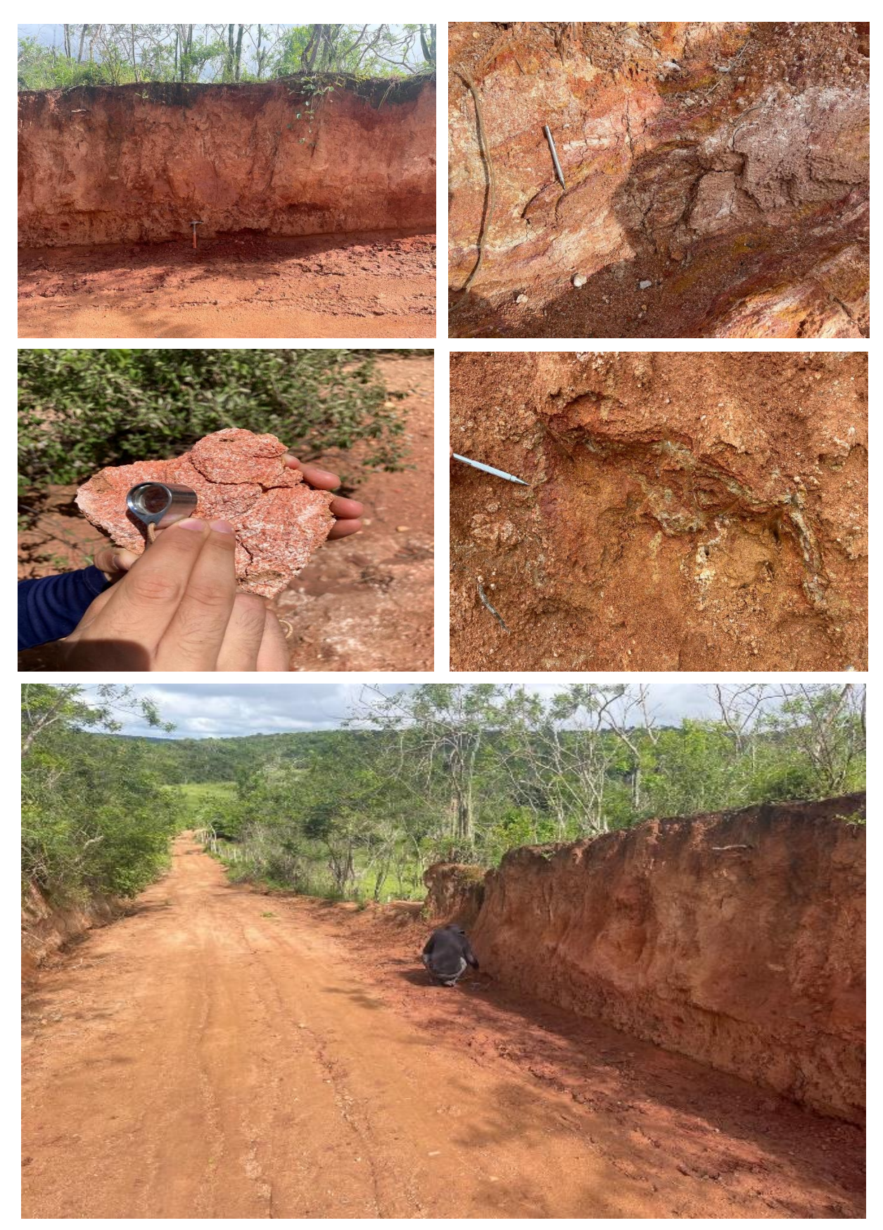
Figure 1 - Outcrop of saprolitic soil rich in clay minerals from the Verde Valor tenements.