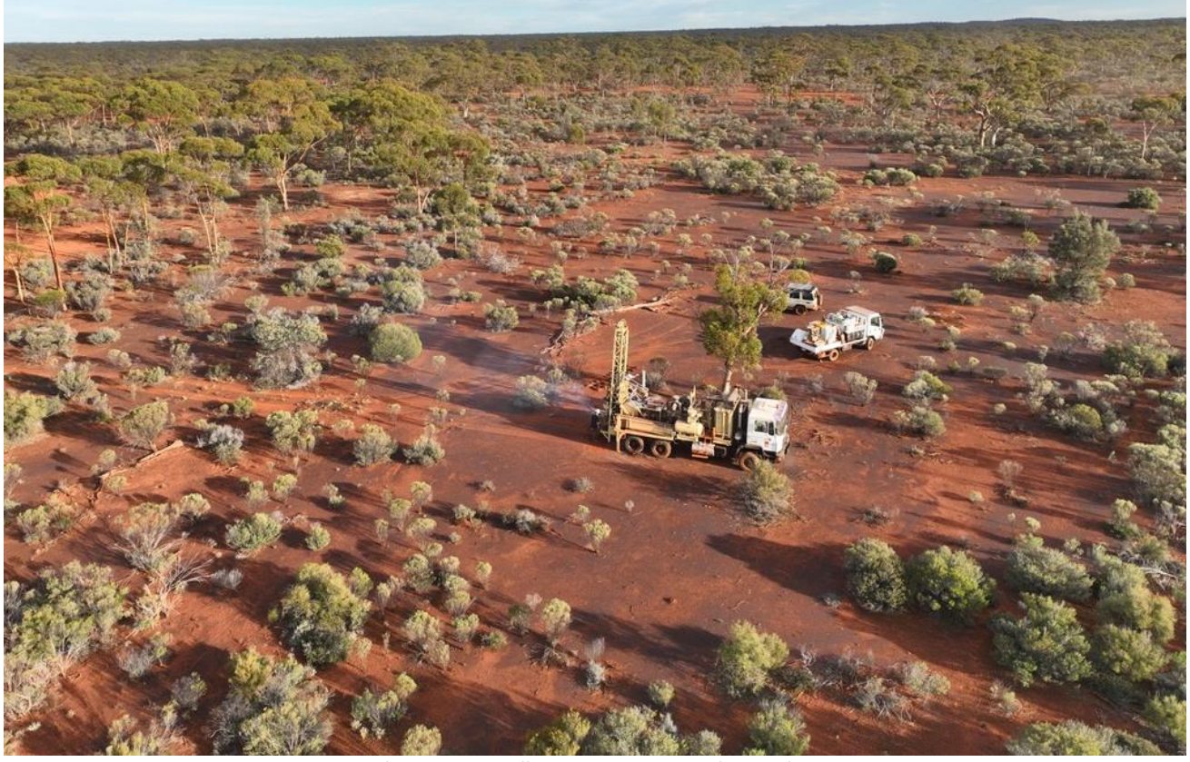
Figure 2: Australian Aircore Drilling AC rig on site at the Northern Zone Project