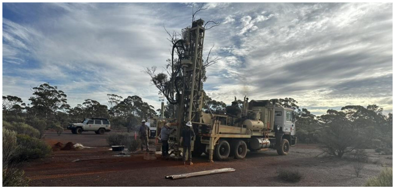
Figure 3: Australian Aircore Drilling AC rig on site at the Northern Zone Project