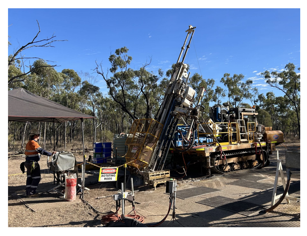
Figure 2 : View of drill rig in place on first diamond drill hole at Glen Eva Project (drilling commenced on 19 May 2024).