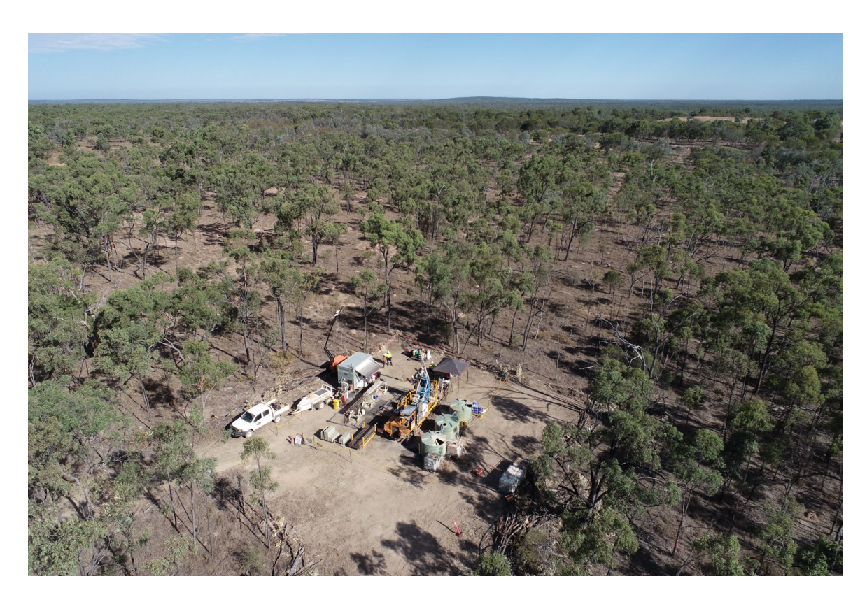
Figure 1: Aerial view of drill rig in place on first diamond drill hole at Glen Eva Project.