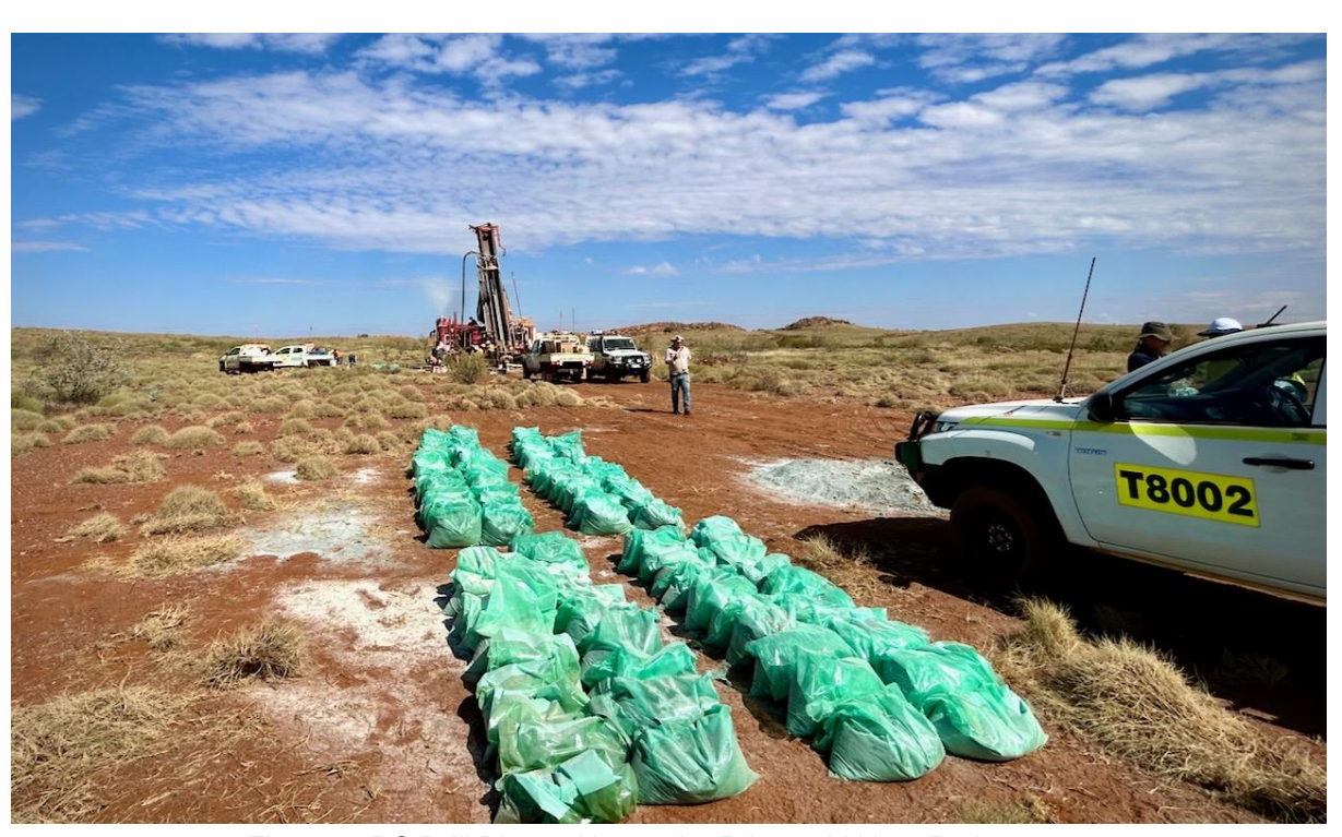
Figure 1: RC Drill Rig working at the Prinsep Lithium Project.

Accelerate Resources Limited ("AX8", "Accelerate" or the "Company") is pleased to provide an update on drilling progress at its 100% Prinsep Lithium project located 15km south of Karratha in the West Pilbara of Western Australia.