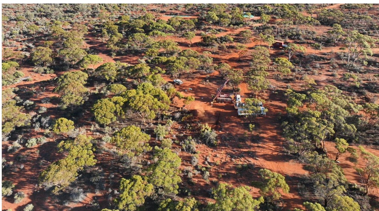
Figure 4: Topdrill RC rig on site at the Northern Zone Project