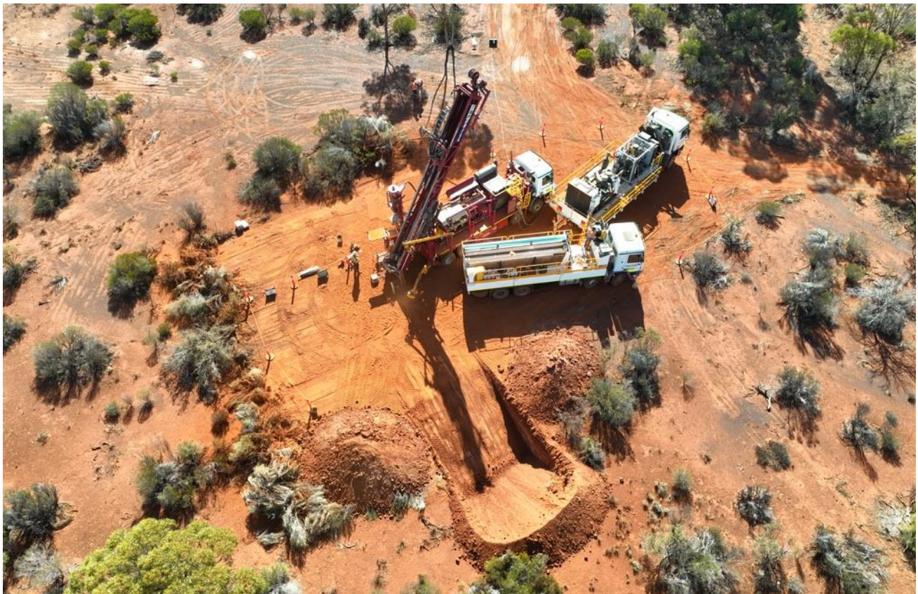
Figure 2: Topdrill RC rig on site at the Northern Zone Project