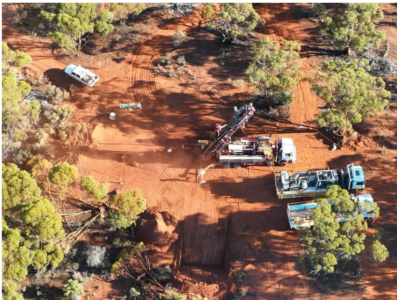
Figure 3: Topdrill RC rig on site at the Northern Zone Project