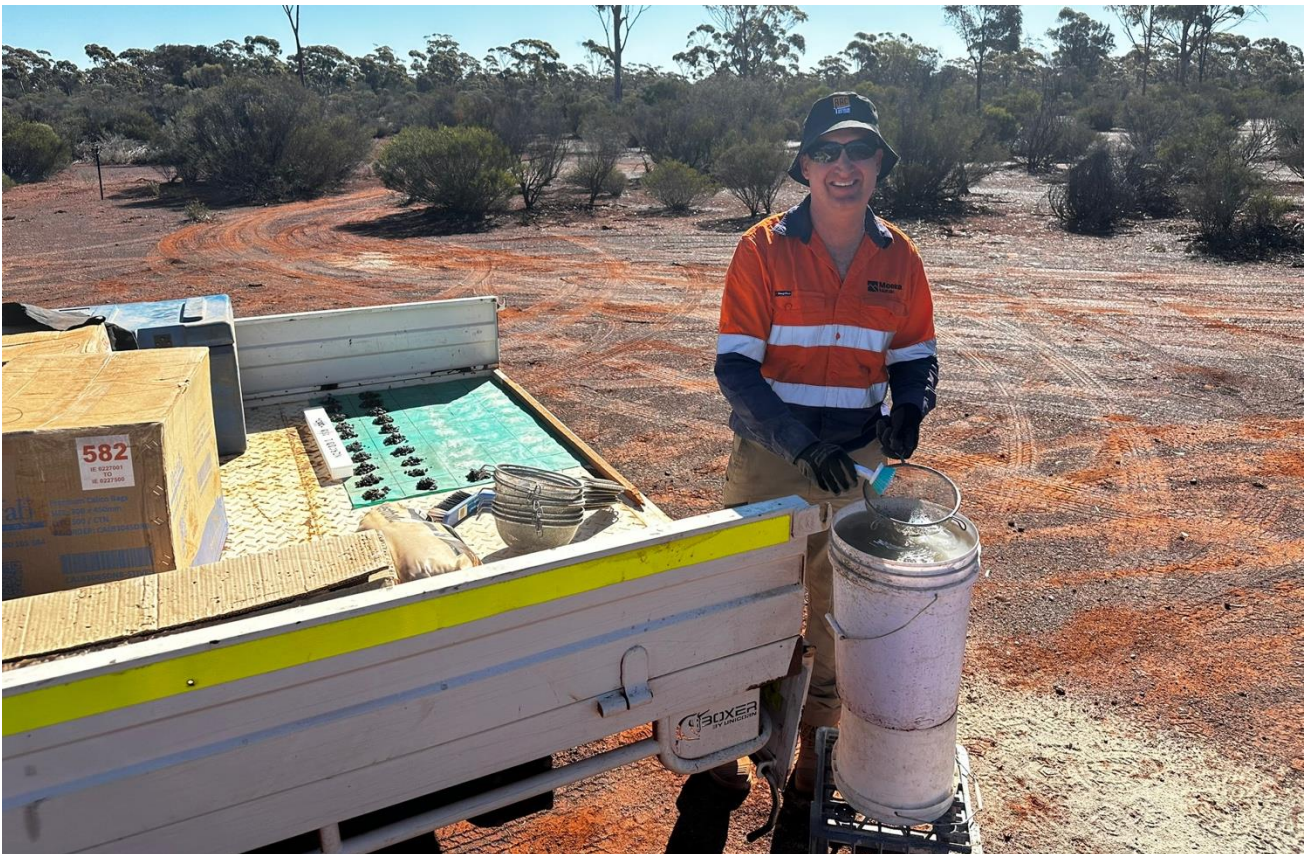
Figure 6: Logging geology on site at the Northern Zone Project