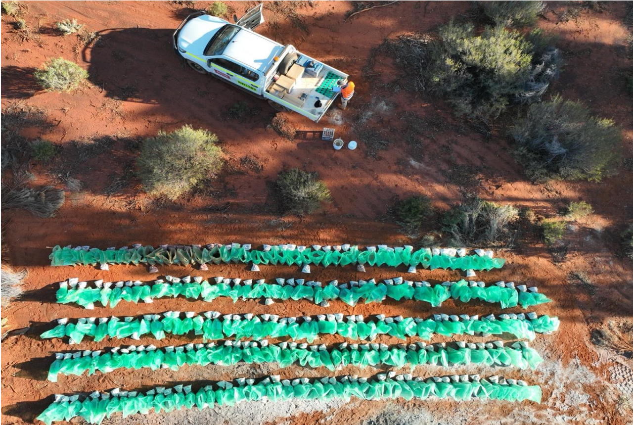
Figure 5: Topdrill RC rig samples and logging geology on site at the Northern Zone Project