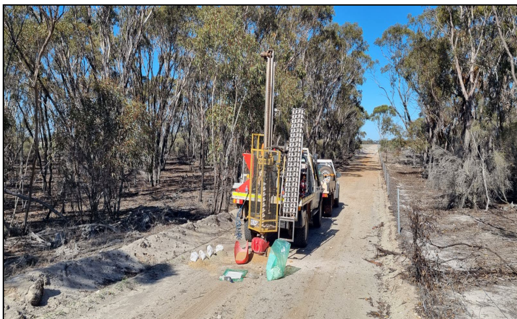
Figure 2. Auger Drilling at ZMI's Cascade Project, May 2024.