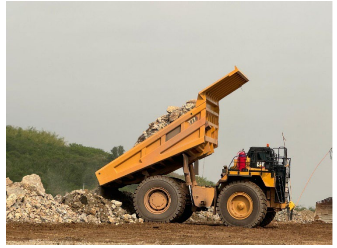
First truck load of fresh ore

• The Kingsgate Board is currently assessing options to consolidate debt to ensure the company is fully funded as we return to steady state production