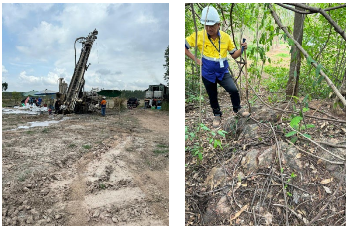
RC drilling and rock chip sampling (May 2024)