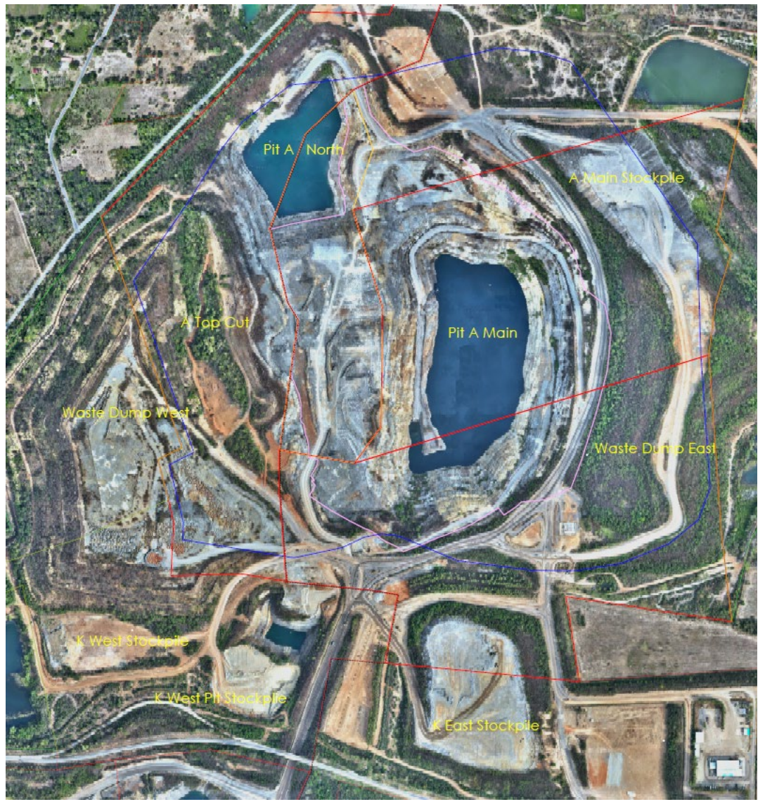
Schematic of Chatree Gold Mine