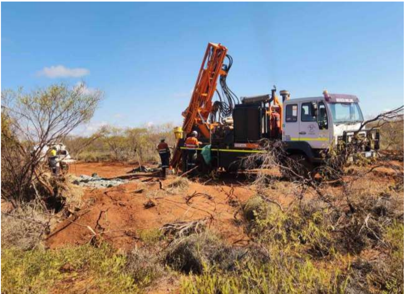
Figure 2: Drill Rig at Mt Berghaus

Mantle intends to use any intersections from aircore drilling at Mt Berghaus, to target reverse circulation drilling later in the year.