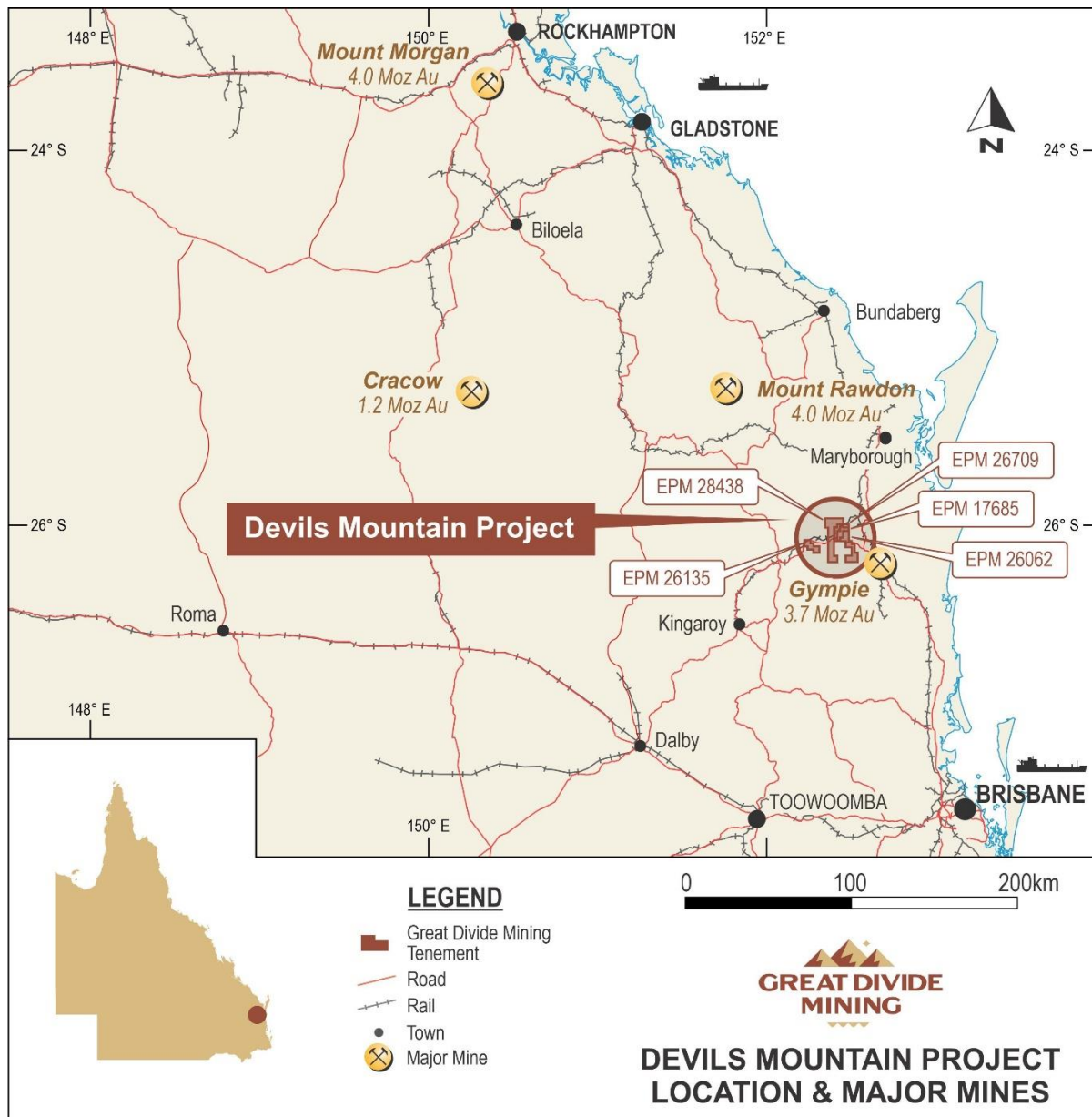
Figure 1 Location of the Devils Mountain Project and tenements