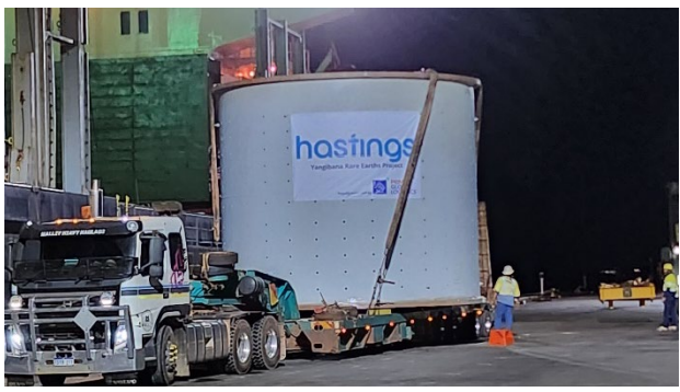
SAG mill shell, landed in Australia and ready for transport to Equipment onshore in Perth ready for installation. Yangibana.