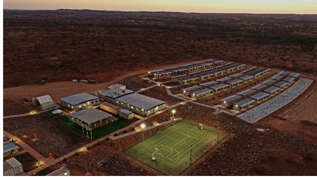
294 rooms fully commissioned with medical centre, sports court, shop, dry and wet mess.