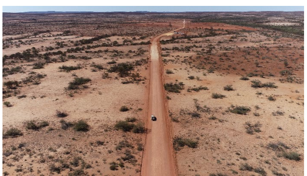
20km site access road to connect the Yangibana Project's mine site with the shire road network to the beneficiation plant, village, mine and construction work.