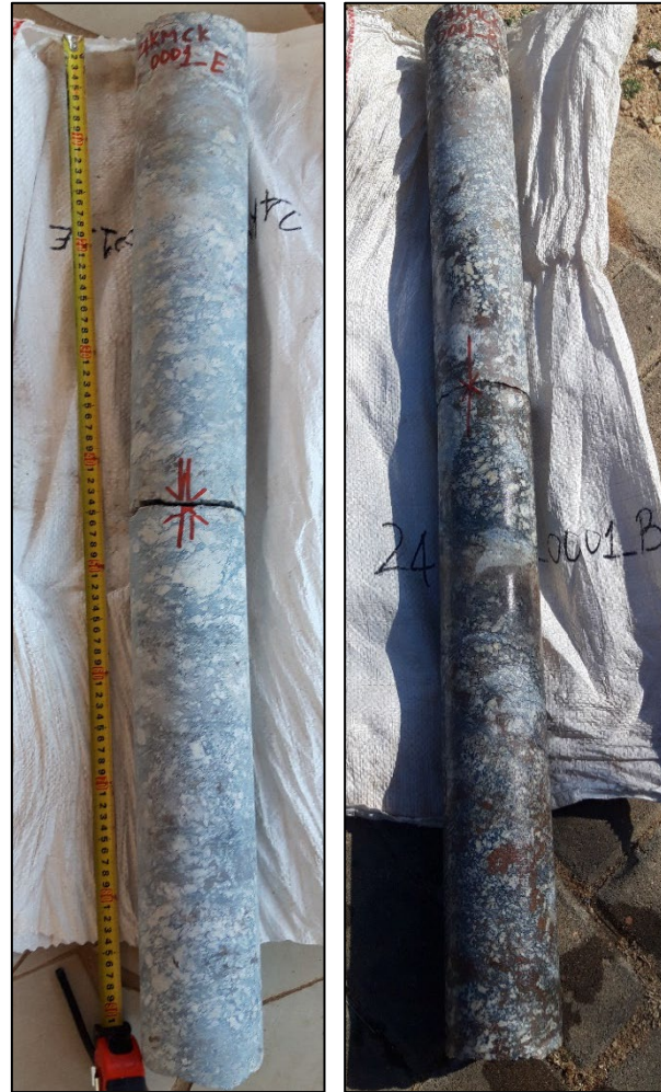
Figure 2: Left, one(E) of the Nb core samples and right, one of the REE core samples(B).