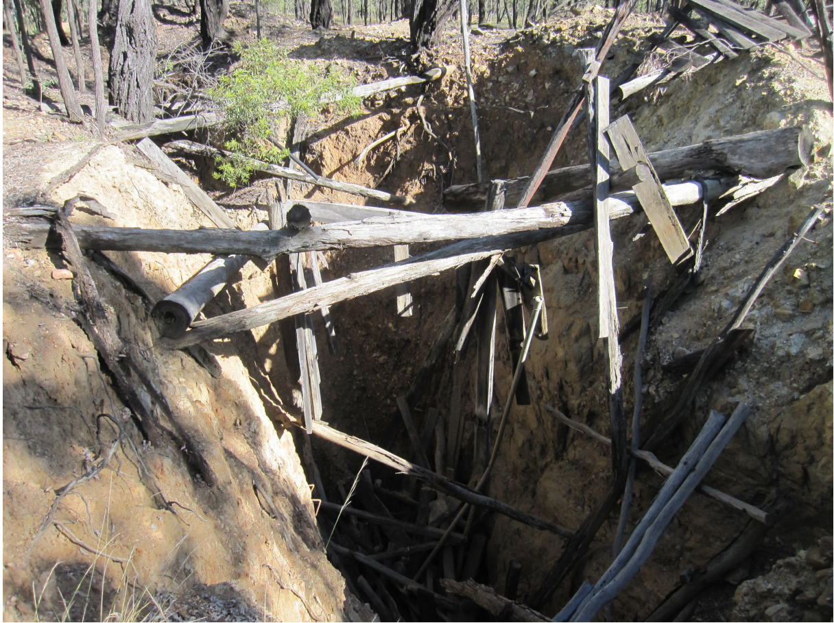
Figure 6 Historic Banshee workings showing unstable shaft requiring protection.