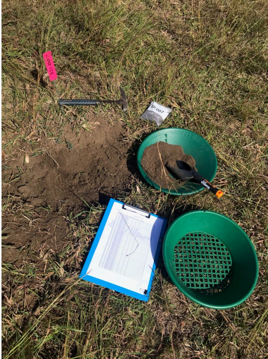
Figure 4 Soil sampling at Coonambula