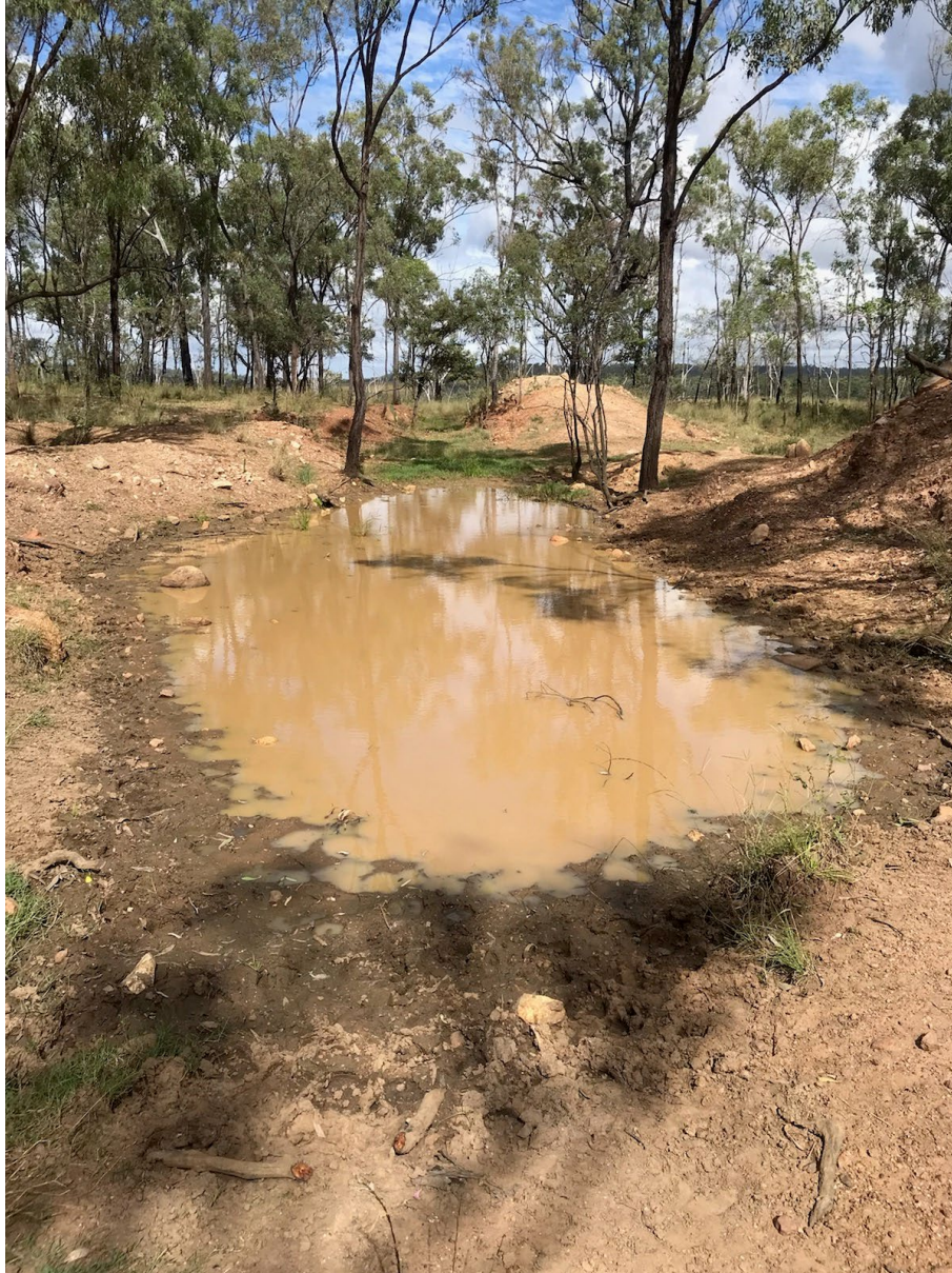
Figure 5 Historic costean showing water ponding and waste rock piles needing remediation.