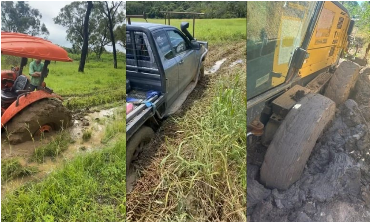
Figure 2 Untrafficable farm tracks in northern Queensland

date – a key landowner recently said, “I’ve not seen anything like this in 40 years, it’ll be another 6 to 8 weeks before we’re not getting bogged everywhere”.