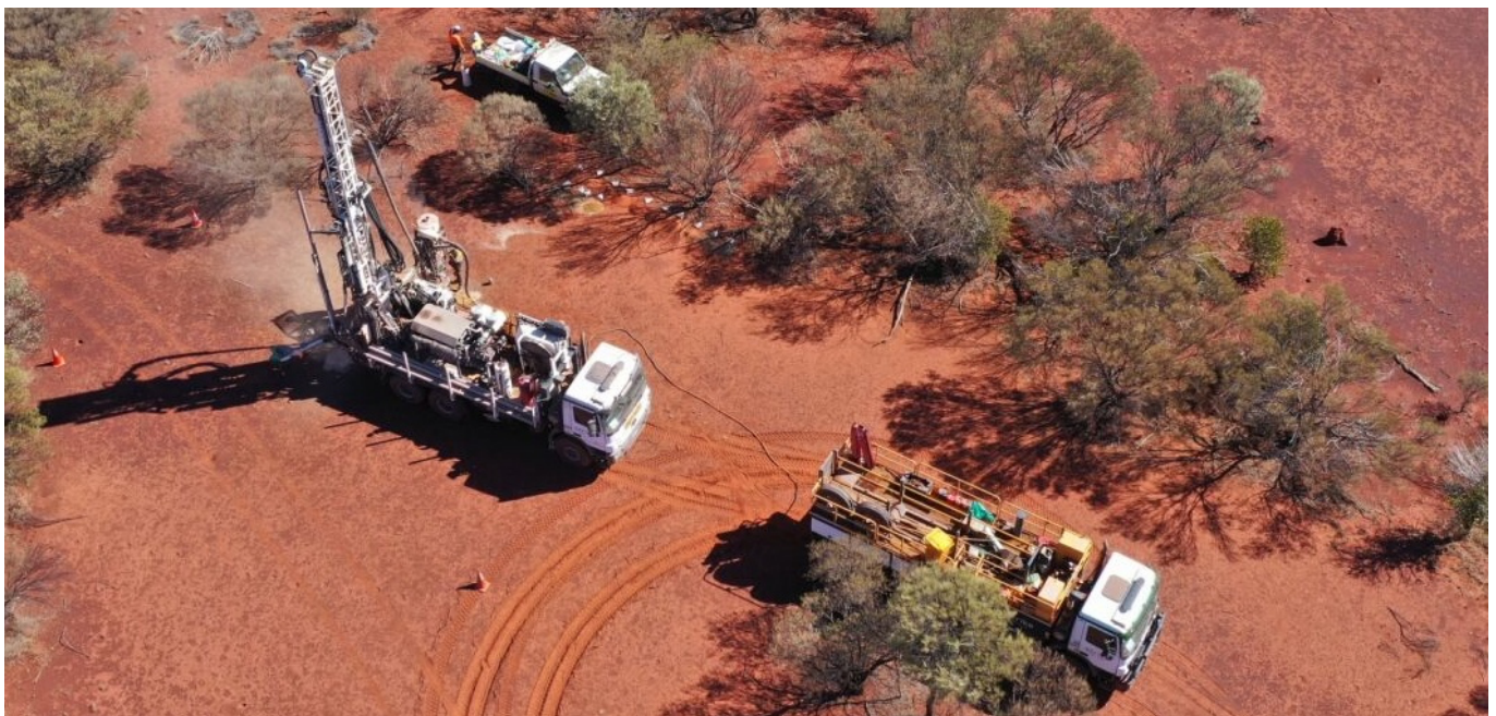
Figure 1: Aerial photograph of the resource infill drilling rig with support vehicles and personnel.