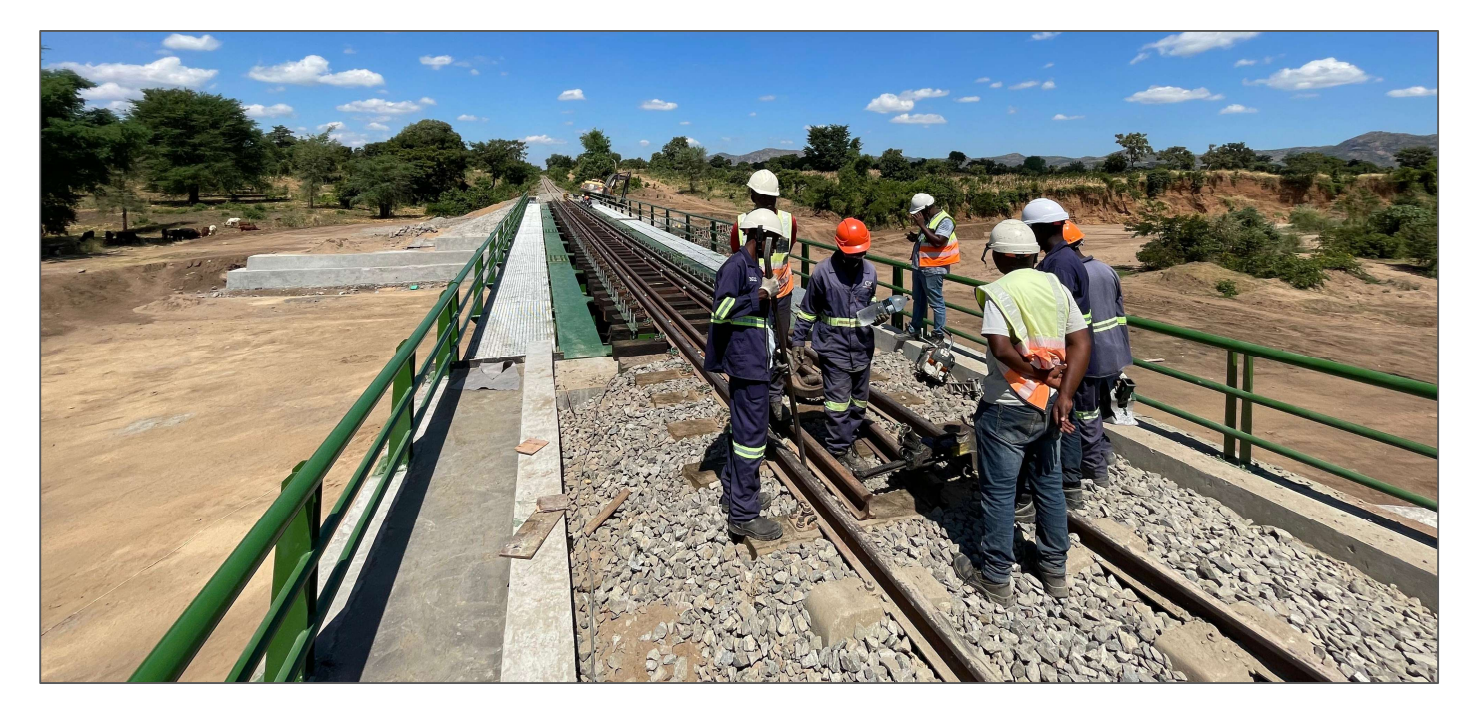
Figure 1: CEAR undertaking upgrade works on a railway bridge connecting Kasiya to the NLC Sovereign Metals Limited | ASX : SVM AIM: SVML

Sovereign Metals Limited (ASX:SVM; AIM:SVML) (the Company or Sovereign) is pleased to report that upgrading of the 399km Nkaya-Mchinji Section Railway (Railway) connecting the Malawi-Zambia border to the Nacala Logistics Corridor (NLC) and which runs across the Company's Kasiya Rutile-Graphite Project (Kasiya or Project) tenements, is underway. Refurbishment of that part of the Railway mainline which connects the Kanengo junction in the Lilongwe District, where Kasiya is located, to the NLC junction at Nkaya is near completion.