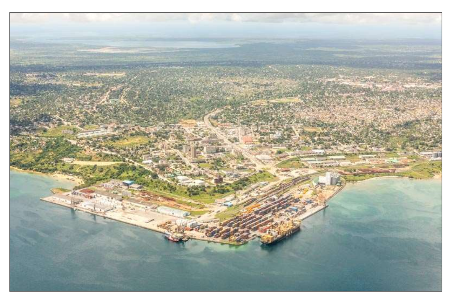
Figure 4: Port of Nacala, Mozambique