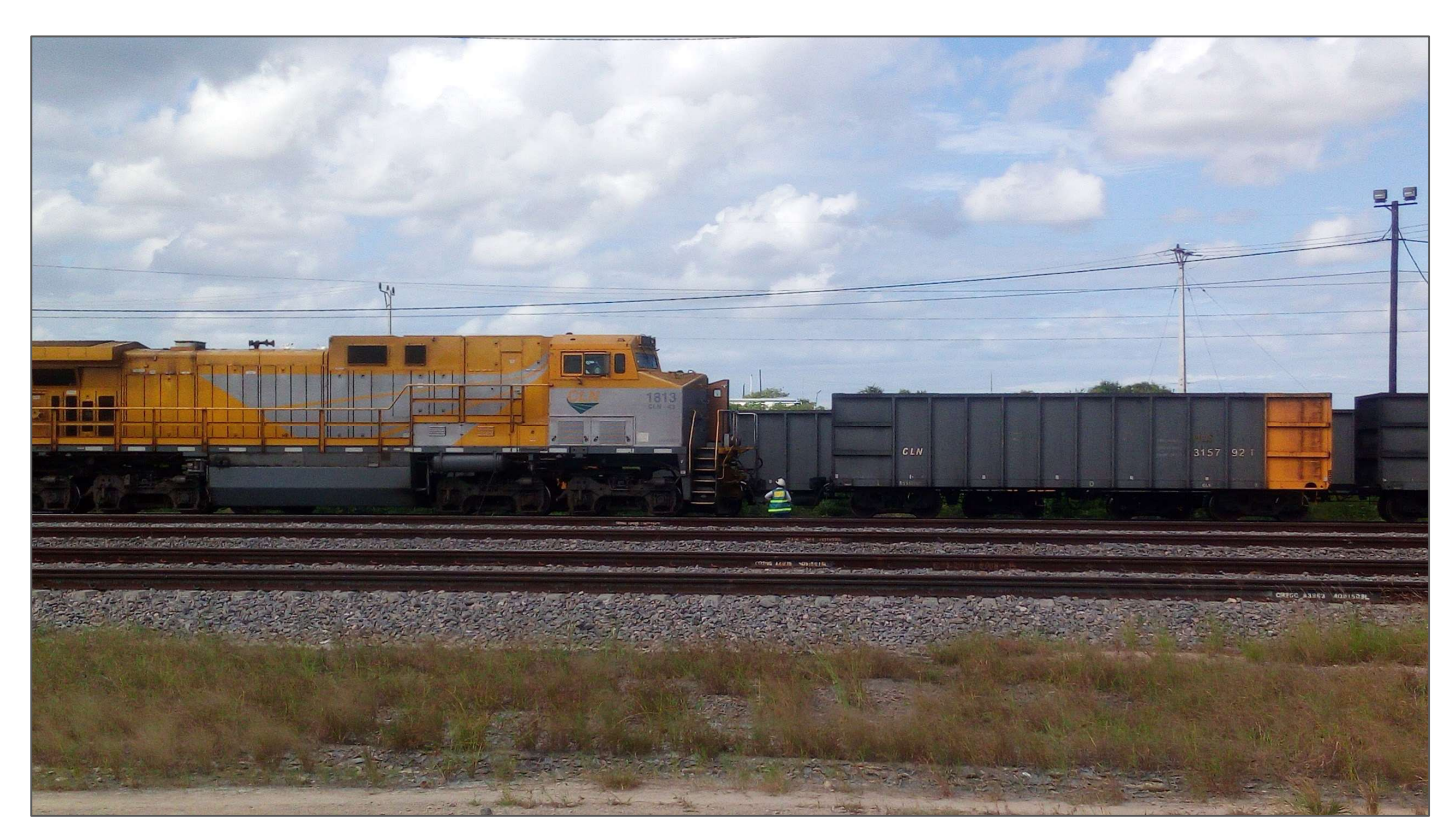
Figure 6: A Nacala Logistics Corridor train