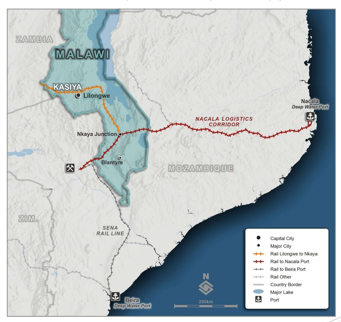
Figure 3: Nacala Logistics Corridor with section currently being upgraded in orange

The Beira Corridor, comprised of the Sena Rail Line and the Port of Beira, provides Sovereign with a second route to export markets and is currently undergoing its own upgrade works. Last year, the Beira Development Corridor Agreement was approved, with the objective of connecting the Democratic Republic of Congo, Zambia, Zimbabwe, and Malawi to the Mozambican Port of Beira through road and rail networks. As Mozambique's second largest port, the Port of Beira is a significant driver of the region's economy and an important gateway for global trade, handling a wide variety of containerised and bulk cargo. The Beira Development Corridor Agreement project aims to eliminate logistical bottlenecks for international and intra-African trade. The African Development Bank (AfDB) is a major financier of the project.