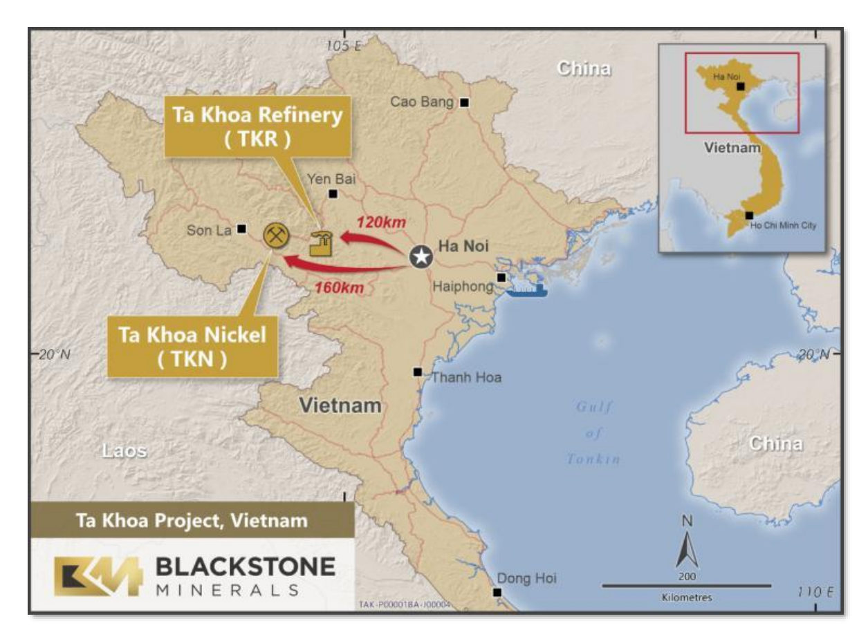
Figure 1: Ta Khoa Project Location