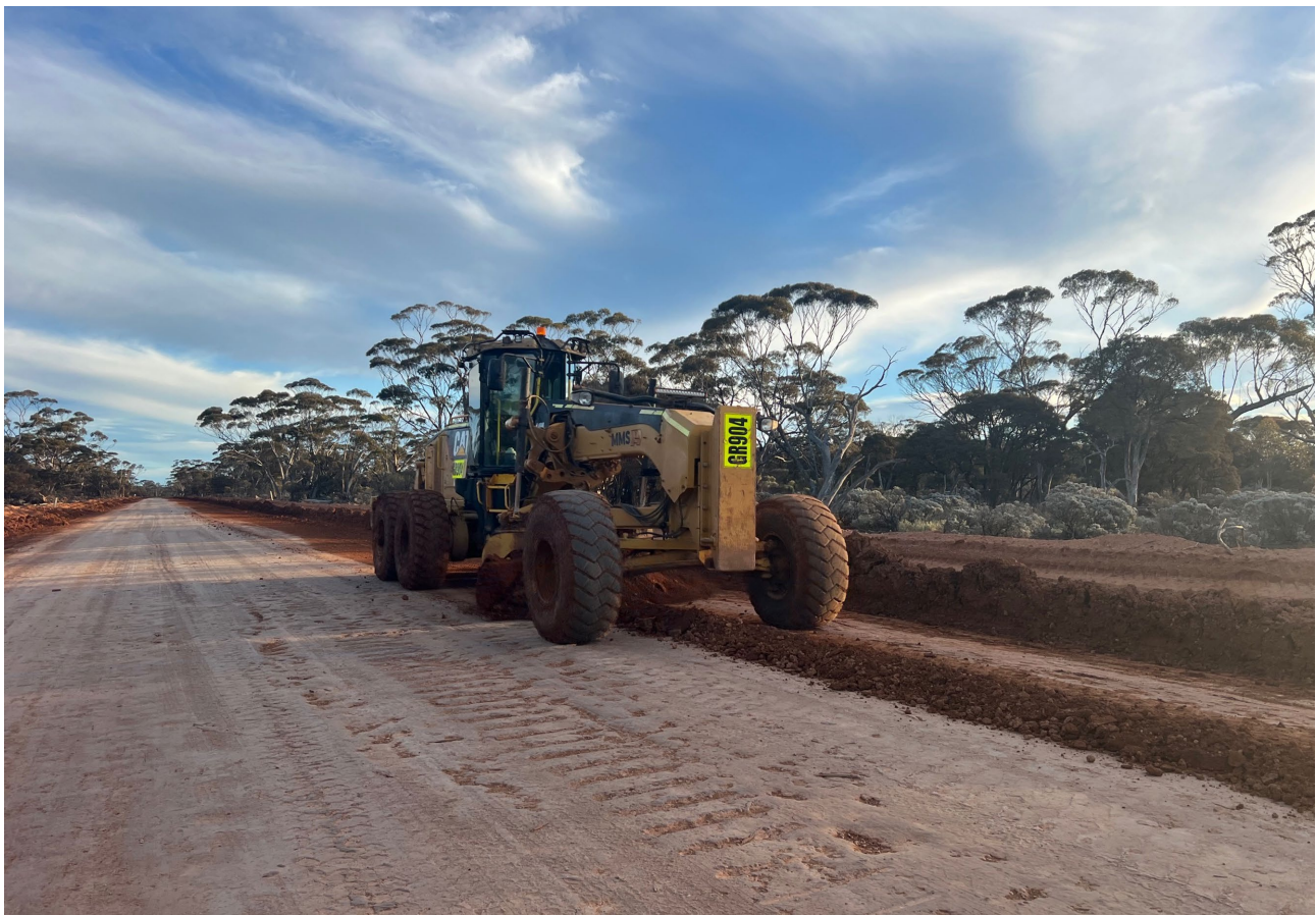
Figure 1: Haul road construction at the Myhree open pit.

Black Cat's Managing Director, Gareth Solly, said: " MMS is making excellent progress developing the Myhree/Boundary site, with haul roads established, mine and waste dump areas cleared, and onboarding of personnel well advanced. "