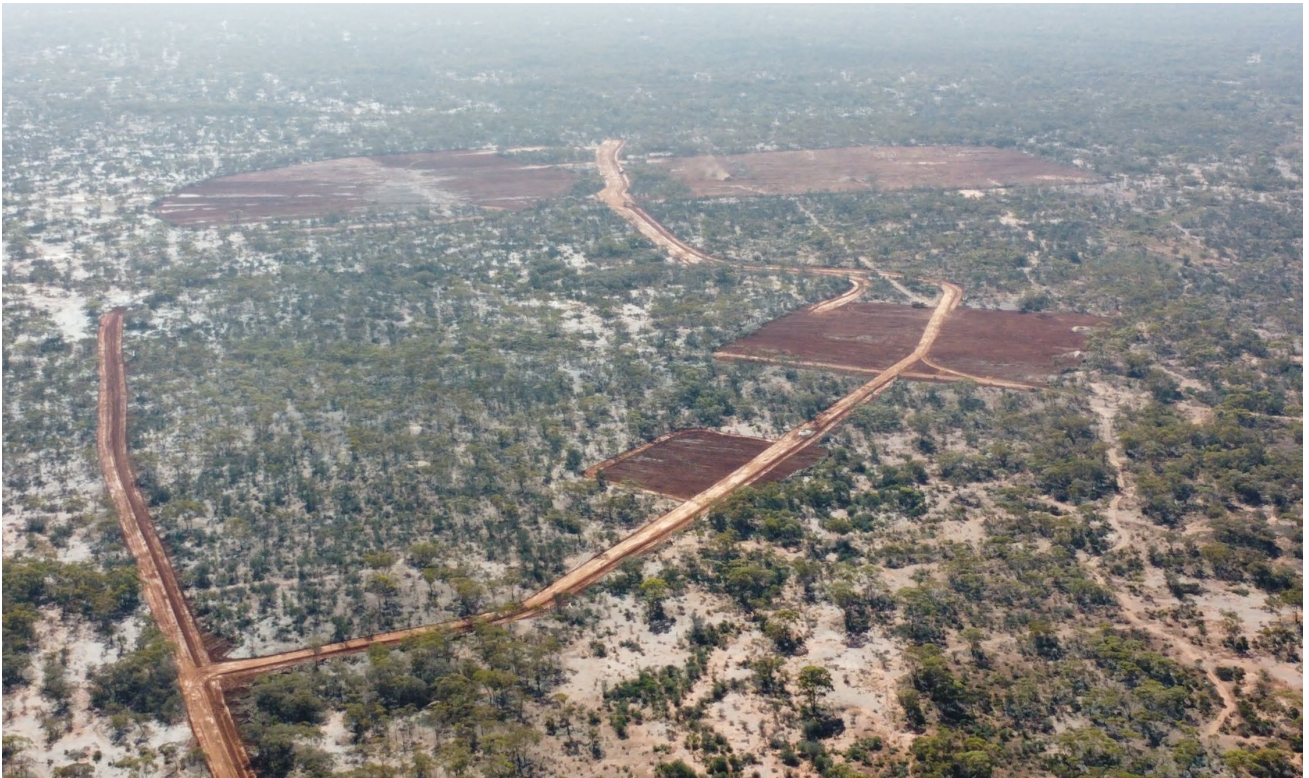
Figure 2: Aerial view of clearing at the Myhree open pit and waste dump (background) and office, laydown and access roads (foreground).

Development has commenced at Myhree/Boundary with clearing activities, haul roads and site establishment.