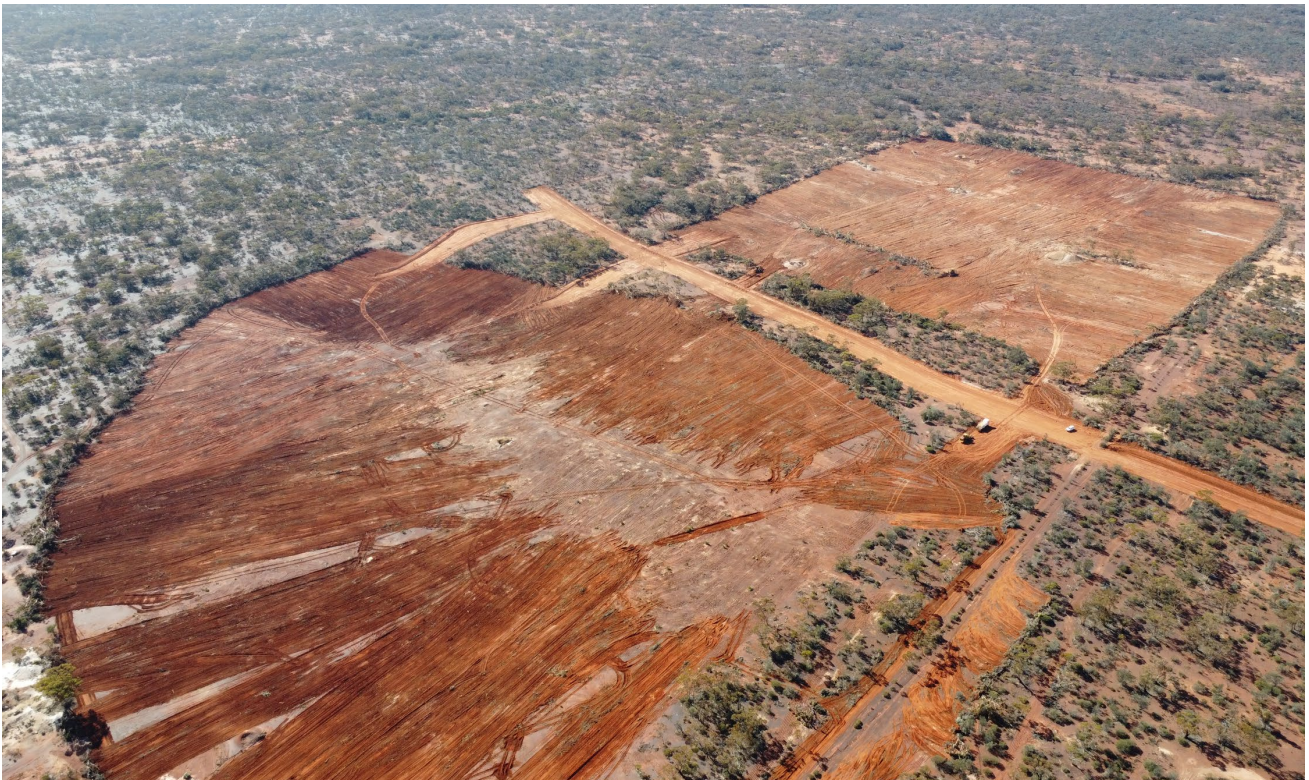
Figure 3: Aerial view of open pit and waste dump clearing at Myhree.