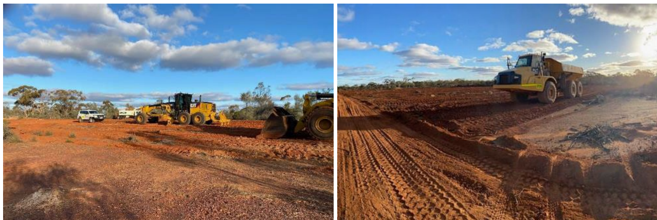
Figure 4 & 5: Clearing at Myhree.