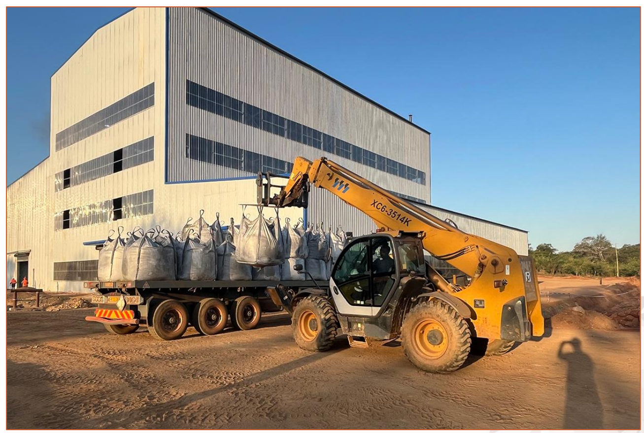
Figure 1. Graphite concentrate being loaded for export in June

Current pricing for orders is at market prices while European prices represent a significant premium to quoted Chinese prices.