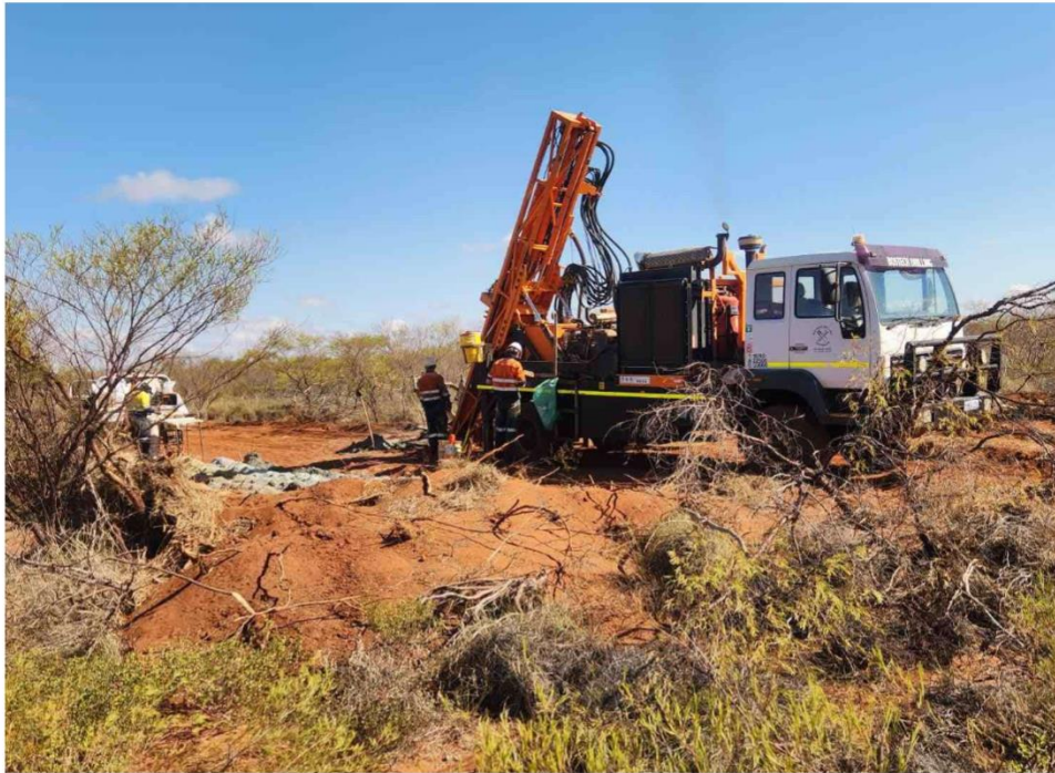
Figure 2: Drill Rig at Mt Berghaus

Results are expected to be received early in Q3.