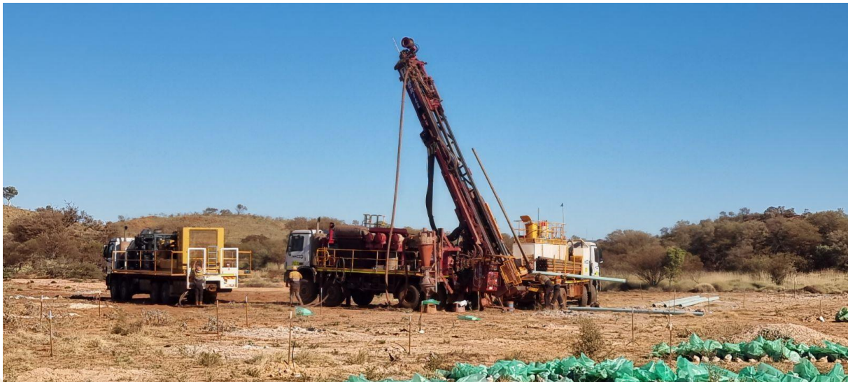
Plate 1: RC Drill Rig On Site at Tin Can Prospect

Peregrine will continue to follow up and extend the greenfield discovery of bedrock hosted gold mineralisation discovered in the first Tin Can drilling campaign (ASX: PGD 12 October 2023) and the second campaign (ASX: PGD 26 June 2024).