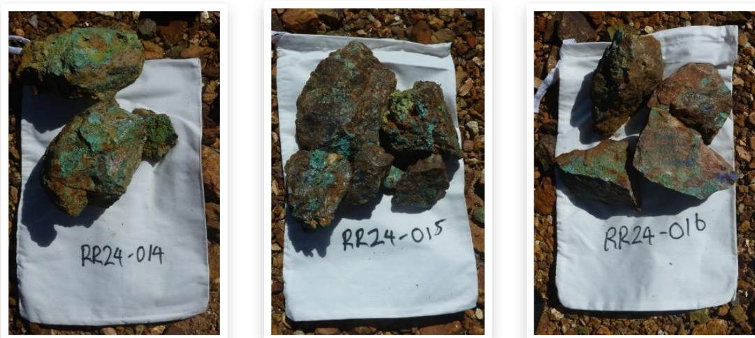
Figure 4. Examples of copper mineralisation at the Reward copper mine, containing green malachite and chrysocolla (copper) mineralisation. Samples RR24-014 (left), RR24-015 (centre) and RR24-016 (right)

Three rock chip samples were taken from the old workings to determine the copper, gold and silver content of variations on the style of mineralisation mined.