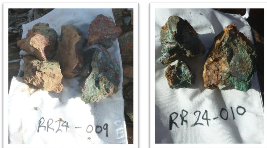
Figure 3. Rock chip samples RR24-009 (left) and RR24-010 (right) from the Scimitar Copper-Gold-Silver Prospect containing green malachite (copper) mineralisation.