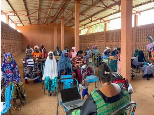
Theory training for moringa processing