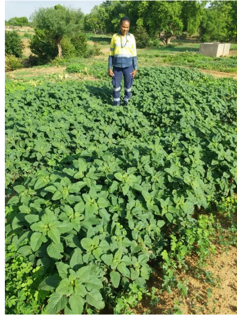
Market garden monitoring of amaranth plots