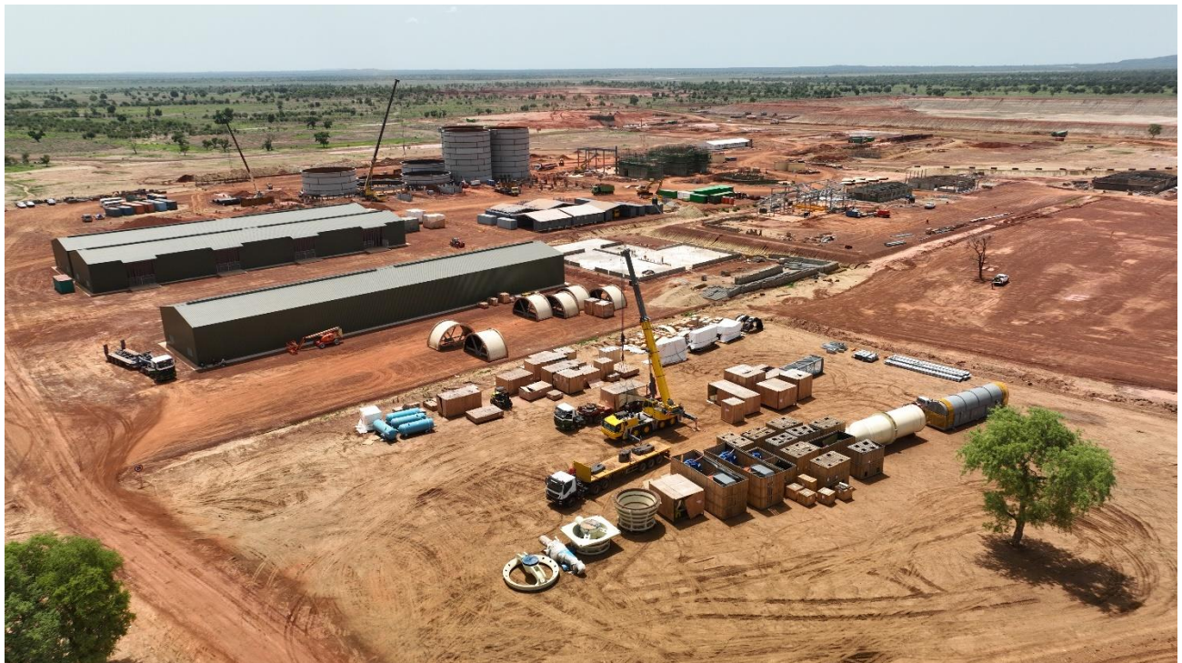
Kiaka Plant Overview (mill shells in foreground)