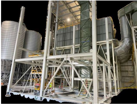
Figure 1: Classifier Structure progress with Bucket Elevator installed at rear