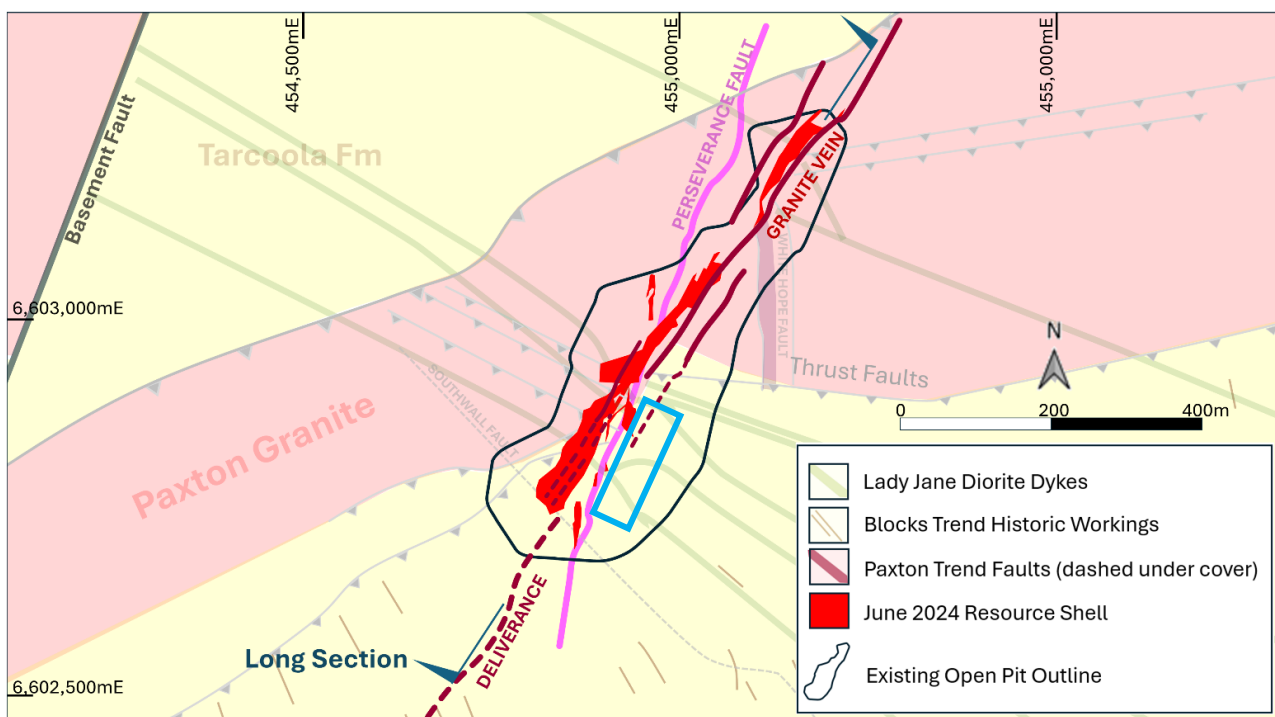
Fig 1 –Perseverance open pit JORC MRE plan view and follow up target area (blue box) 1

Barton Gold Holdings Limited (ASX:BGD, FRA:BGD3, OTCQB:BGDFF) ( Barton or Company ) is pleased to confirm that its drilling program testing multiple targets near the Tarcoola Gold Project’s ( Tarcoola ) Perseverance open pit mine is now complete, with 9,052m RC drilling completed across 44 days’ drilling. 2