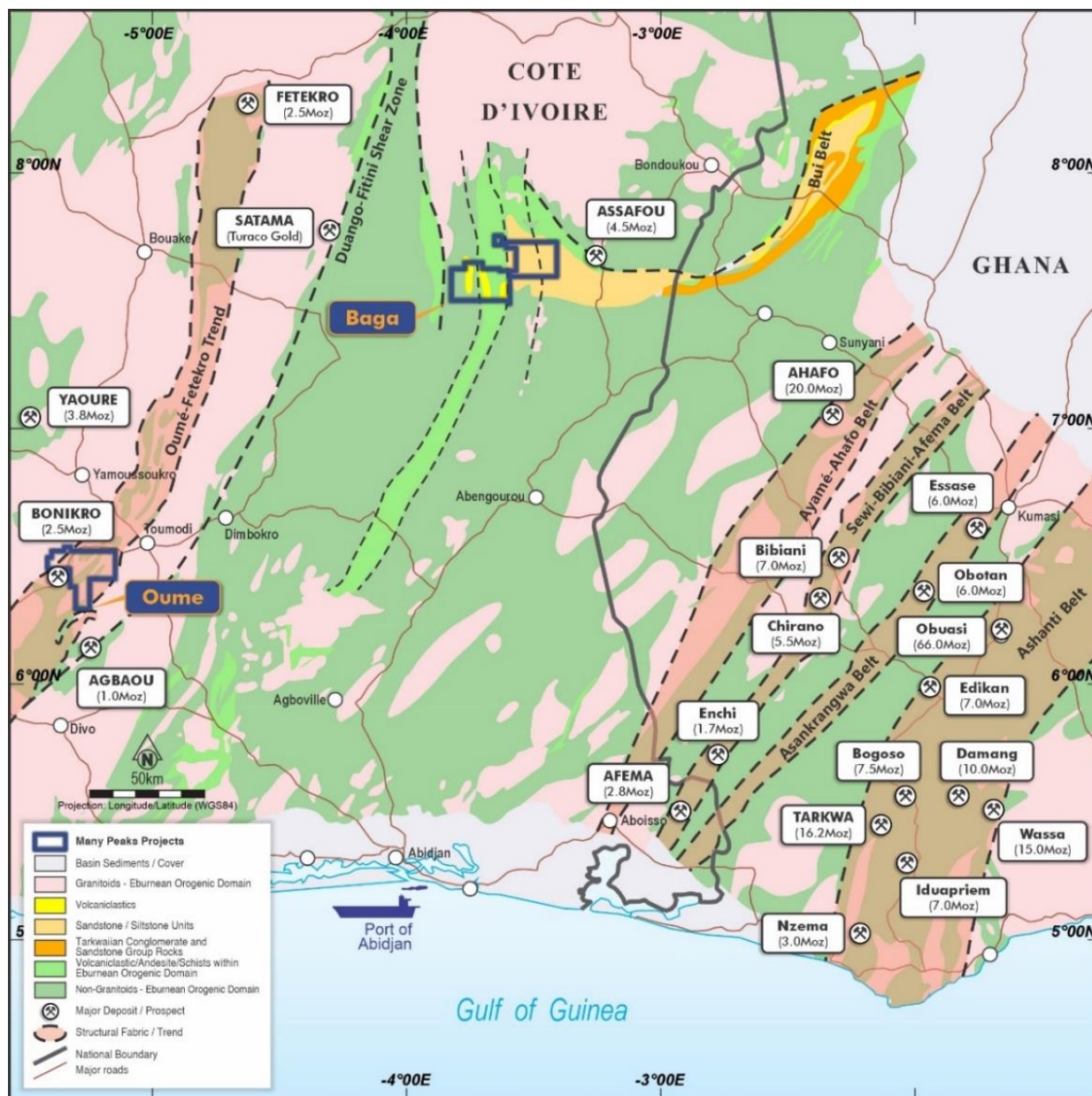
Figure 2: Baga and Oumé project locations on generalised regional scale geology interpretation

Comprised of two recently granted permits in Côte d'Ivoire, the Baga Project is located 150km east of the city of Bouaké (Figure 2) and covers an underexplored region of structural complexity located just 21km east of a recent greenfields gold discovery by Endeavour Mining who have rapidly defined a 4.5Moz Assafoú gold resource estimate located on the Tanda-Iguela project area over the past three years (Figures 1&2).