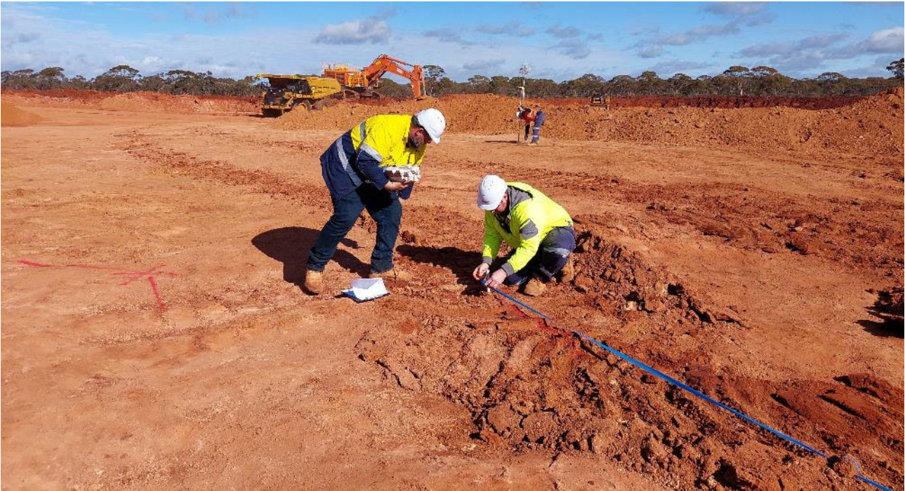
Figure 2: First Ore being marked up at the Myhree open pit (pink >3.0g/t Au, blue <3.0g/t Au).

Ore mining and 24-hour operation is underway at Myhree/Boundary with first ore mined on 26 July 2024.