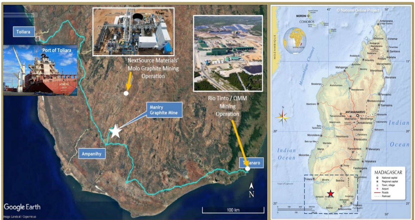
Figure 4– Maniry location adjacent to existing large-scale operations