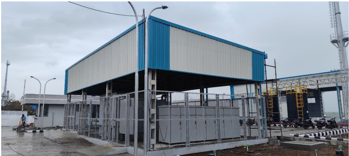
Figure 1 – Part of the completed production plant

No lost-time injuries have been reported over the quarter. Evion executive team continues monitoring the development of the operation and making sure the project’s delivery approach adheres to strict HSE guidelines.