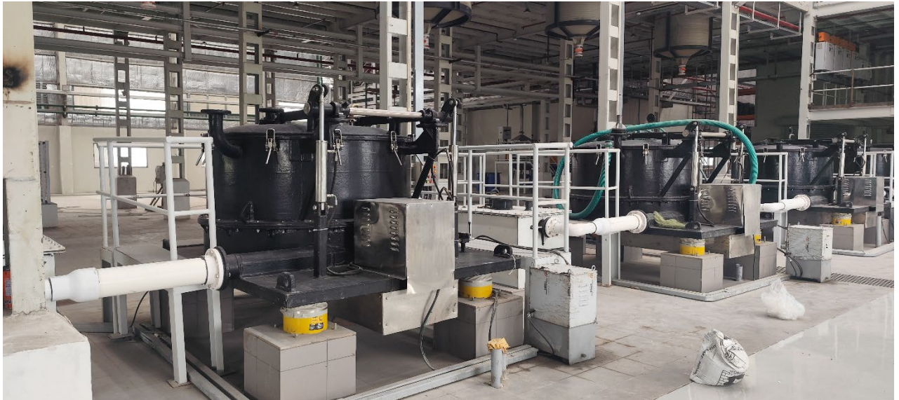
Figure 2 – Part of the production circuit on site