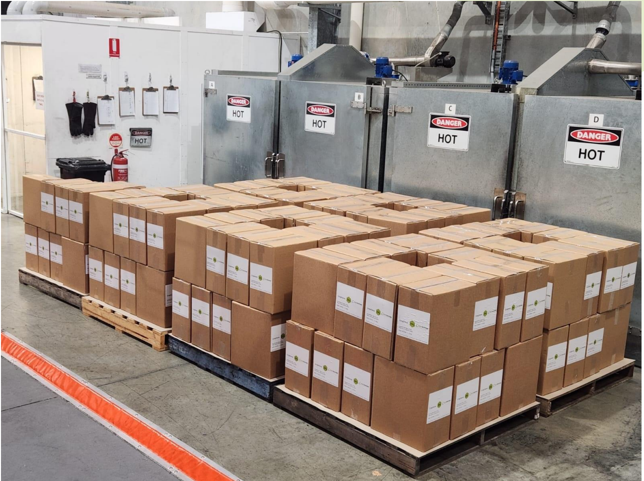
Figure 2: PureGRAPH-CEM® ready for shipment ahead of third trial with Breedon Group

The Company also received further positive results from the first world-leading field trial conducted with Breedon earlier this quarter, with the graphene enhanced concrete slab maintaining strength and integrity with no defects, damage or deterioration detected after 200 days in operation.