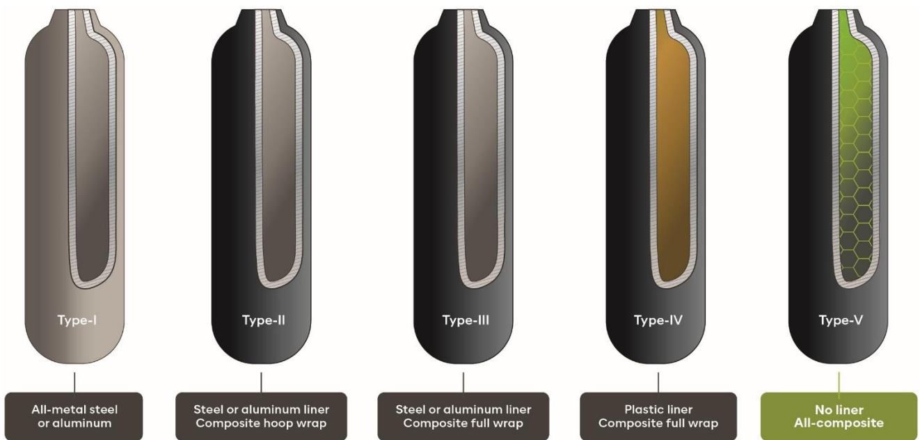
Figure 3: Five common pressure vessel types including Type-V tank.

First Graphene will develop graphene enhanced resins, which will be incorporated into a Type-V tank to reduce hydrogen permeability and increase strength in composite systems (see below).