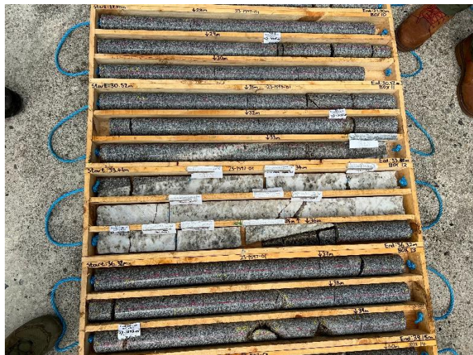
Figure 5. Drill Core from Knockeen

During the process of technical due diligence, the management team had a site visit in Ireland May, with a number of meetings held with the stakeholders, including the government representatives at GSRO in Dublin to establish strong working relationship to further development of the Leinster project and community development plan. The management team had also visited local geochemical laboratory, to assess the operation capabilities for planning exploration campaigns.