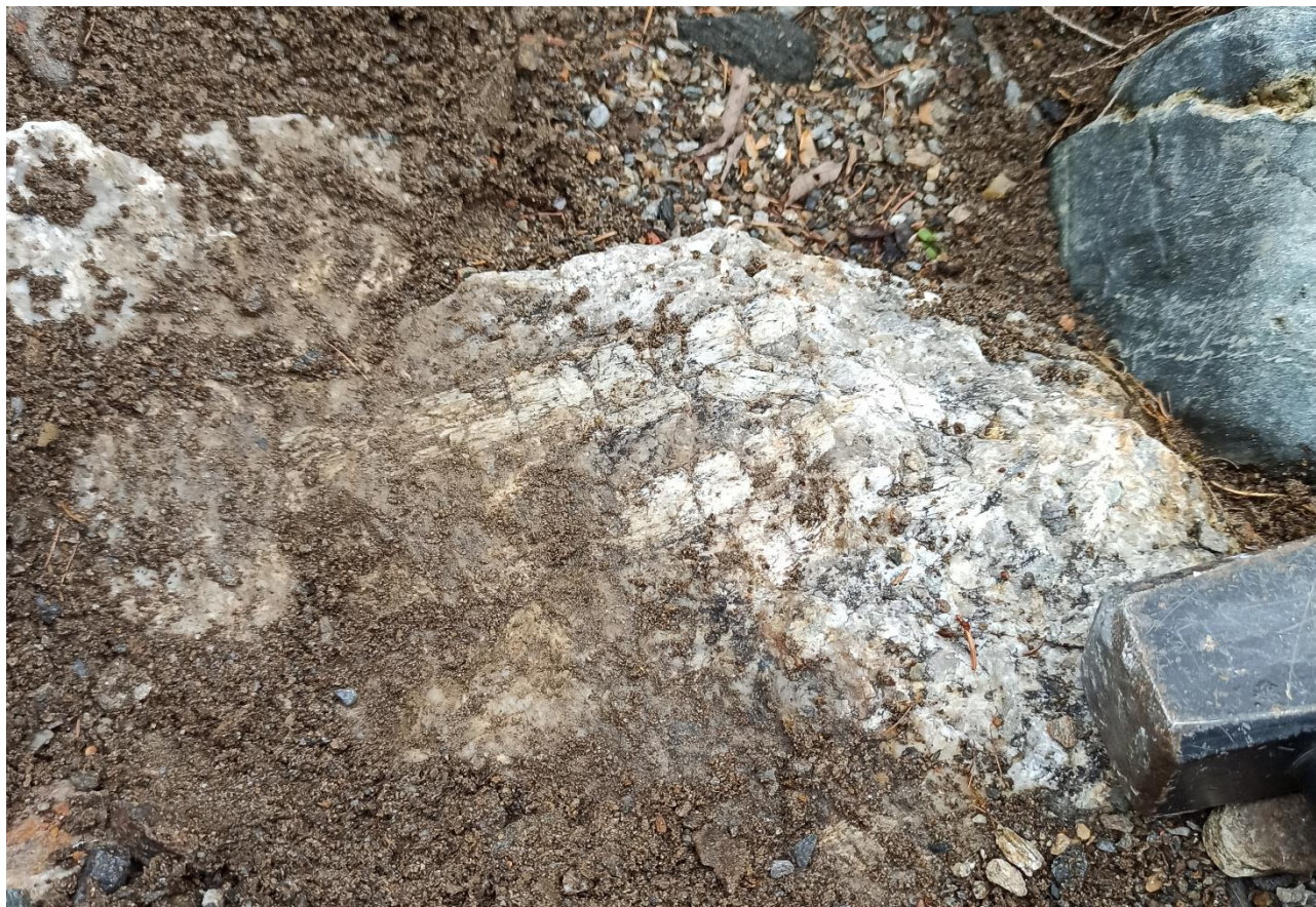
Figure 2: Newly identified spodumene outcrop from Bretstein-Lachtal

The additional target areas are a result of a detailed desktop study that has been done parallel to stakeholder negotiations. Final land access agreements and approvals are pending.