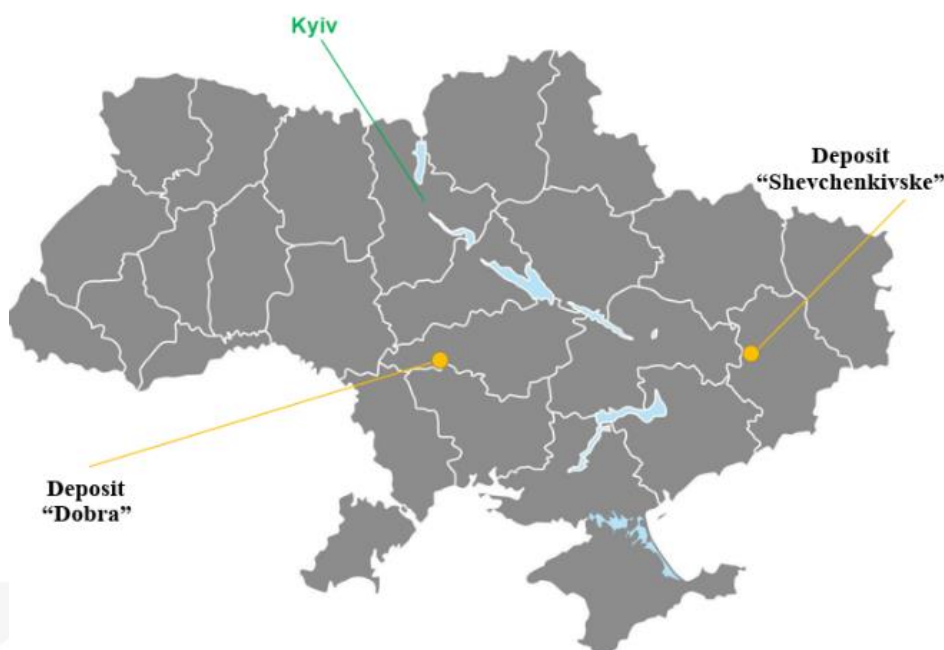
Figure 6. Location of the Deposit Shevchenkivske and Dobra in Ukraine

On 2 January 2024, the Company announced that it had renegotiated the terms under which EUR acquired European Lithium Ukraine LLC (formerly Petro Consulting LLC) ( European Lithium Ukraine ), a Ukraine incorporated company that is applying (through either court proceedings, public auction and/or production sharing agreement with the Ukraine Government) for 20-year special permits for the extraction and production of lithium at the Shevchenkivske project and Dobra Project in Ukraine (refer figure 6), from Millstone and Company Global DW LLC ( Millstone )( Millstone Transaction ).