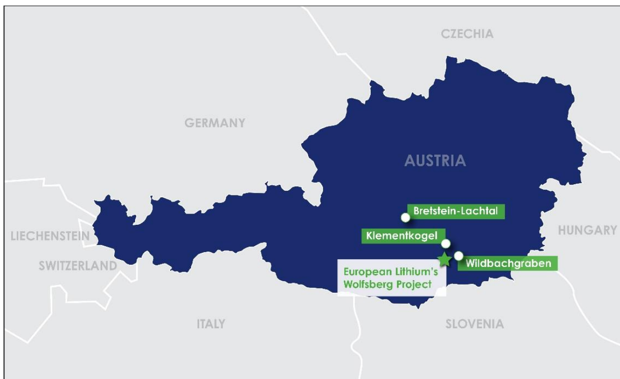
Figure 1. Austrian Lithium Projects location

The Company's Bretstein-Lachtal Project, Klementkogel Project and the Wildbachgraben Project (together Austrian Lithium Projects ) consist of 245 exploration licenses covering a total area of 114.6 km 2 and are located approximately 80km from the Wolfsberg Project (refer Figure 1). The licenses cover ground that is considered prospective for lithium occurrences in the Styria mining district of Austria.