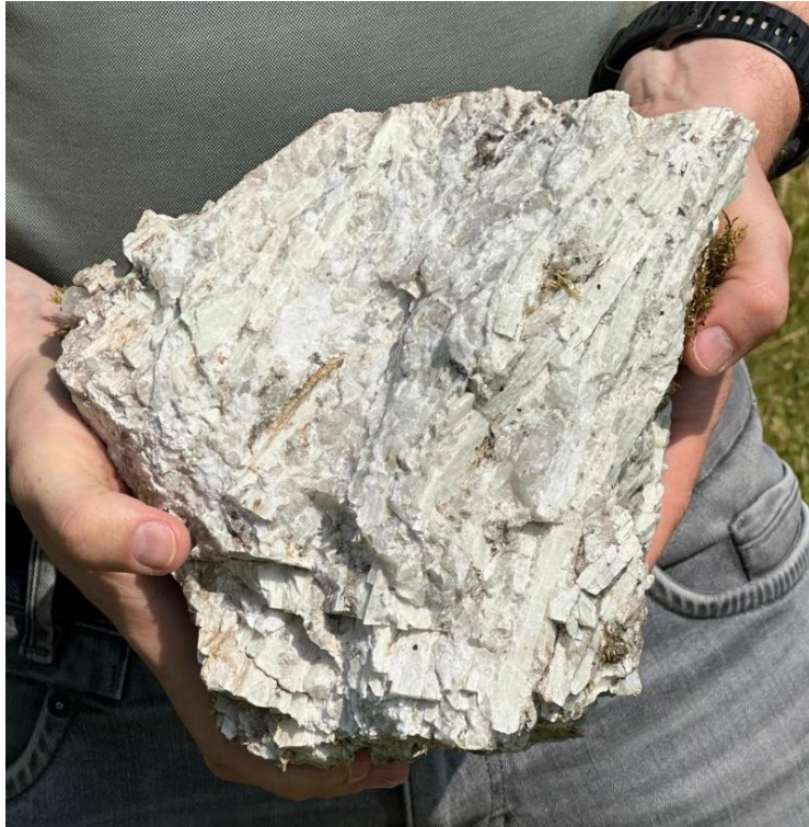
Figure 3: Spodumene crystals from Knockeen

During the process of technical due diligence, the management team had a site visit in Ireland May, with a number of meetings held with the stakeholders, including the government representatives at GSRO in Dublin to establish strong working relationship to further development of the Leinster project and community development plan. The management team had also visited local geochemical laboratory, to assess the operation capabilities for planning exploration campaigns.