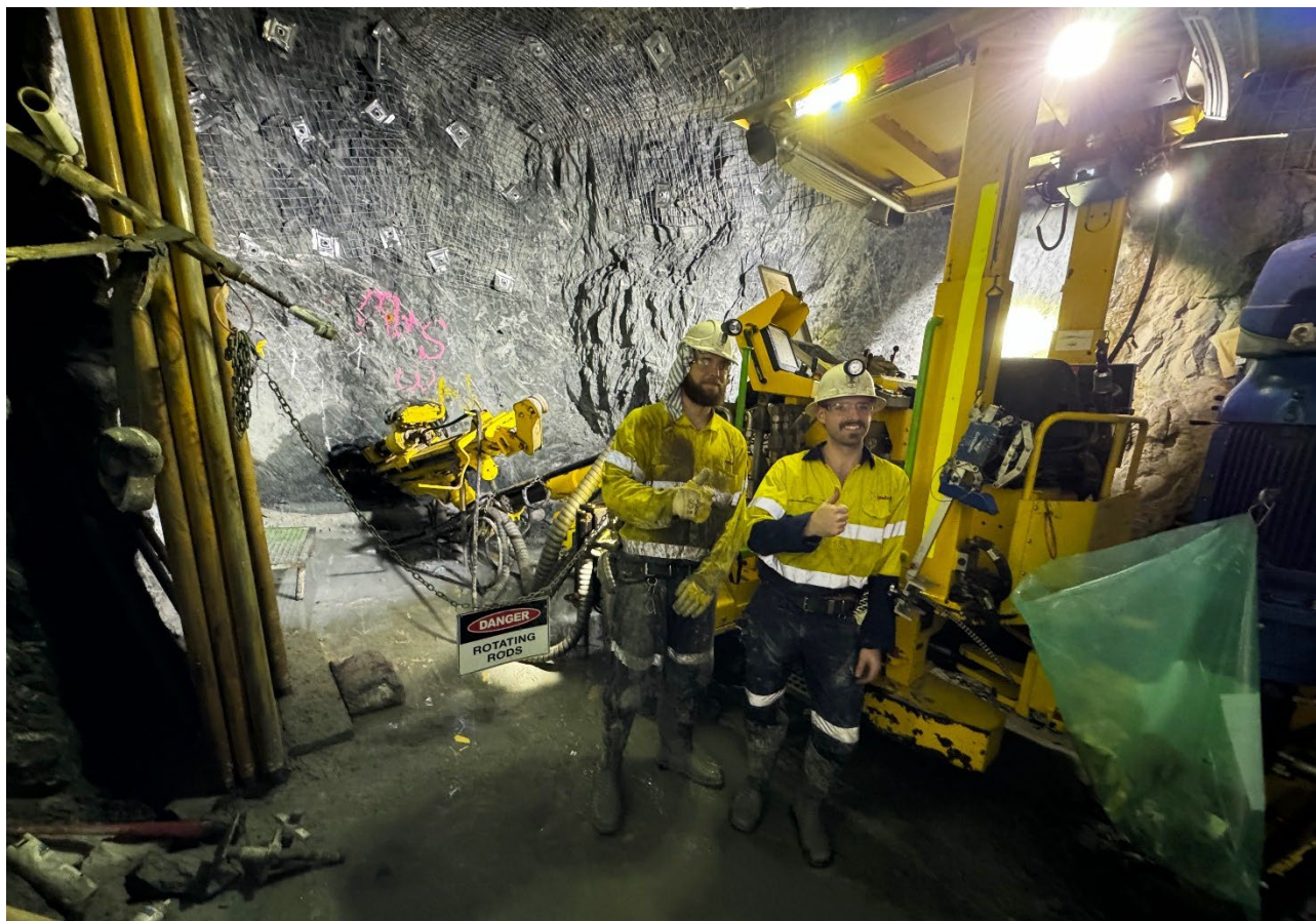
Figure 2: Diamond drill rig mobilised and drilling commenced