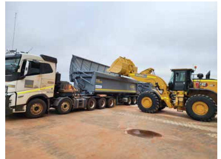
First Qube truck being loaded from Kathleen Valley