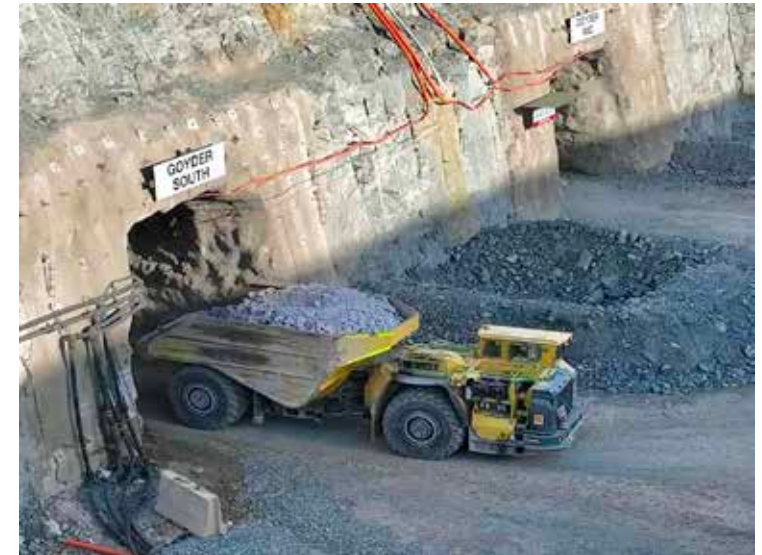
Development ore trucking out of Goydor South

Next: First Production of Ore from the stoping cycle anticipated by the end of CY2024.