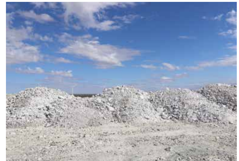
Underground development ore stockpiles