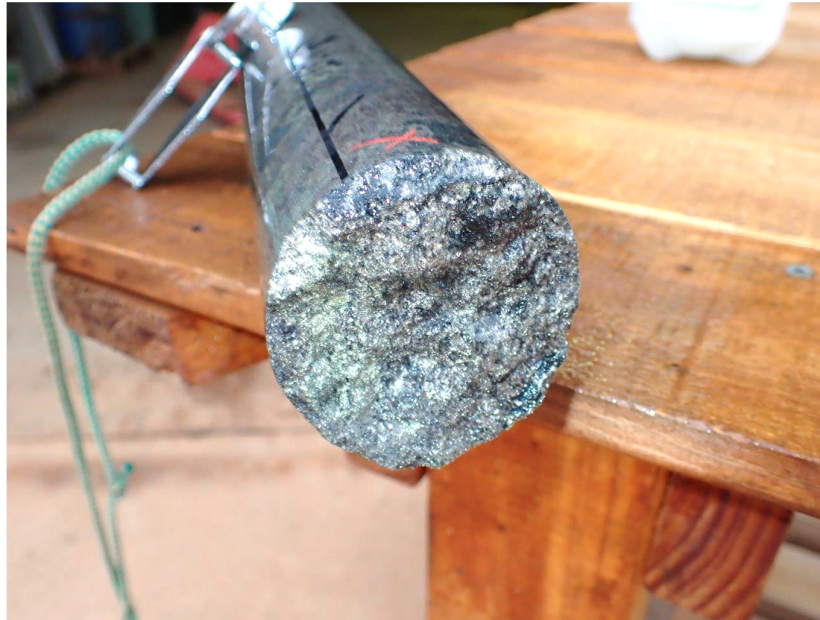
Figure 4: Massive sulphide mineralisation in 24AED001