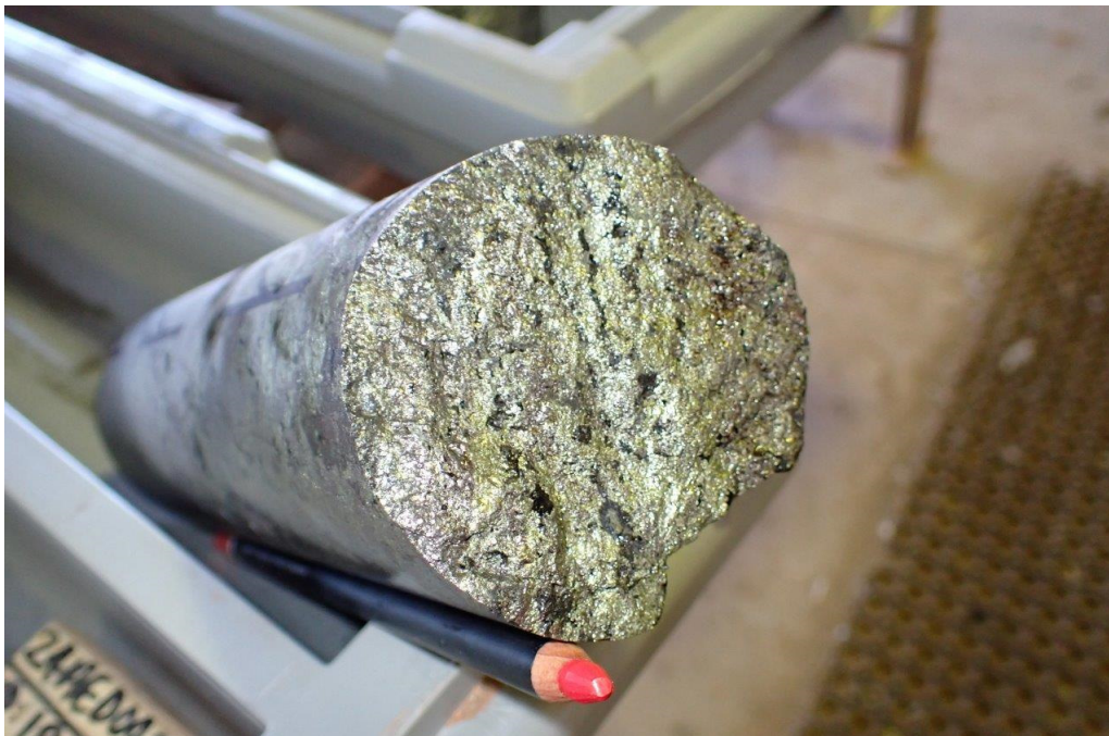
Figure 1: Massive sulphide mineralisation in 24AED002A