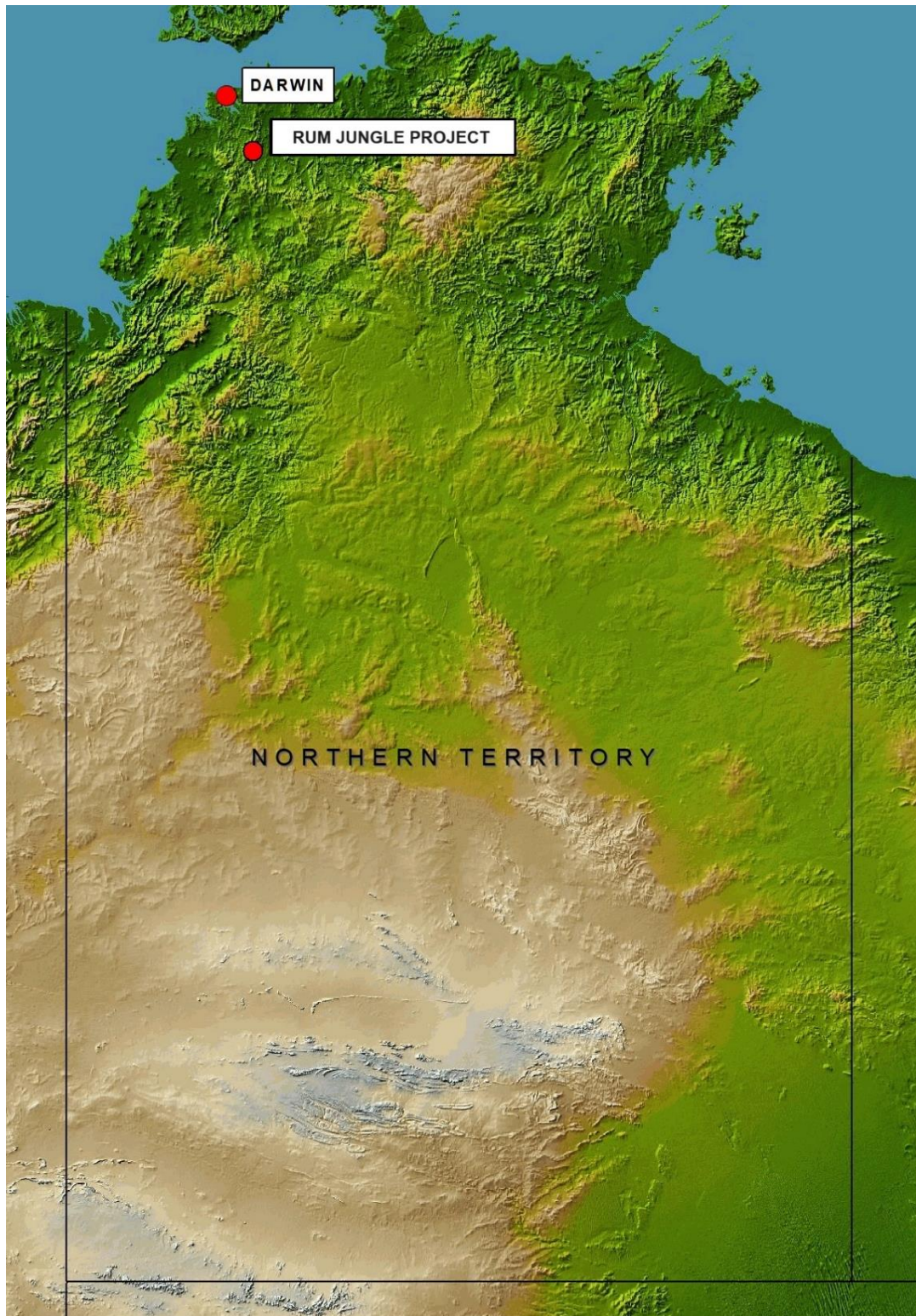
Figure 1 Rum Jungle Project Location